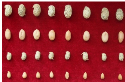
Figure 1. Pods and seeds of mutant type (top 2 rows) and wild type (bottom 2 rows) of A. duranensis

The mutant was identified in a separate square cement block allotted to A. duranensis in the wild peanut nursery at SPRI Experiment Station, Laixi. The plant was grown from a seed of similar size to that of A. duranensis , but was found to possess thicker branches, and larger leaflets, pods and seeds (Figure 1, Table 9). The size and weight of pods and seeds of wild and mutant type A. duranensis significantly differed ( P < 0.01 ).