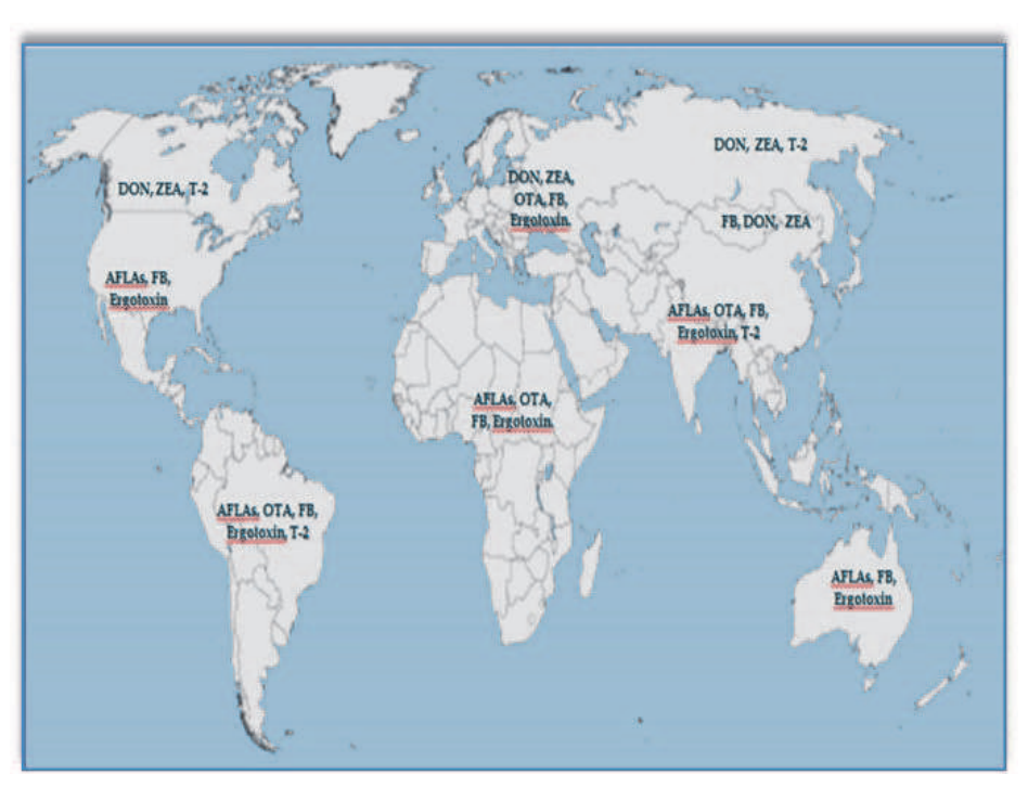
Fig. 3. Distibution of mycotoxins around the world. (AFLAs: Aflatoxins; FB: Fumonisins; OTA: Ochratoxin A; ZEA: Zearalenone; T-2: T-2 toxin).

ZEA and DON in North America; AFLs , FUMO, OTA, DON and T-2 toxin in South America; ZEA and DON in the Eastern European Countries; OTA, ZEA and DON in the Western European regions (Bhat et al., 2010; Van Egmond & Jonker, 2004; WHO, 2002a). However, with the open global trade these mycotoxins might also be detected in all areas of the world.