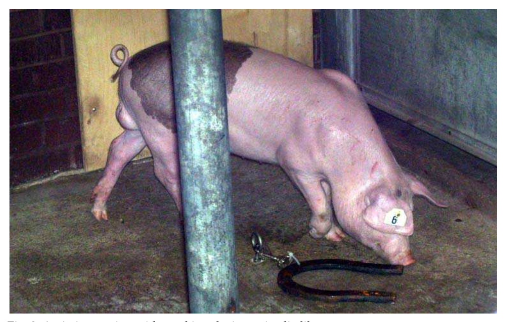
Fig. 2. A pig interacting with an object during episodic-like memory test.