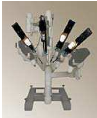
Fig. 1. da Vinci robot