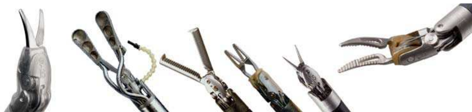
Fig. 5. Instruments

The third component is the surgical cart which is composed of three to four arms for controlling the 3D camera and two to three surgical instruments. The robotic instruments are “wristed”, thereby providing 7 degrees of freedom ( df ) compared with 4 df with traditional laparoscopy (fig 5). The robotic instruments are controlled by the principal surgeon who sits away from the patient at the surgical console via two “masters”. The movements of the surgeon’s arms and legs are translating in real time to the robotic instruments inside the patient’s abdomen and are processed and scaled to reduce any tremor and thus enhance precision of movements and avoid tissue trauma.