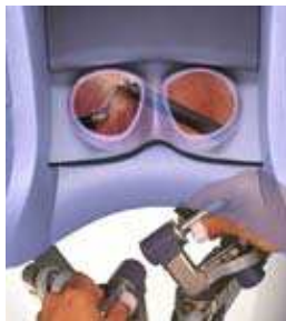
Fig. 3. 3D optics

The camera consists of two high definition units which recreate a true 3D colour image which is viewed by the surgeon at the console. The camera allows for up to 12 x magnification of the operating field, opening up the possibility of performing microsurgical procedures as well as spotting and managing small blood vessels to reduce bleeding and performing nerve sparing surgical dissection (fig 4). Three cameras are available for use on the de Vinci system, one straight and two angled cameras (up and down pointed), which allows the surgeon the options of viewing all nooks and corners of the pelvis and abdomen.