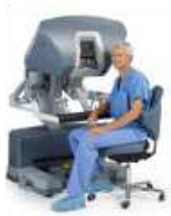
Fig. 2. Console