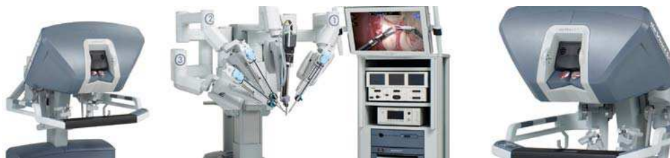
Fig. 4. Products

The third component is the surgical cart which is composed of three to four arms for controlling the 3D camera and two to three surgical instruments. The robotic instruments are “wristed”, thereby providing 7 degrees of freedom ( df ) compared with 4 df with traditional laparoscopy (fig 5). The robotic instruments are controlled by the principal surgeon who sits away from the patient at the surgical console via two “masters”. The movements of the surgeon’s arms and legs are translating in real time to the robotic instruments inside the patient’s abdomen and are processed and scaled to reduce any tremor and thus enhance precision of movements and avoid tissue trauma.