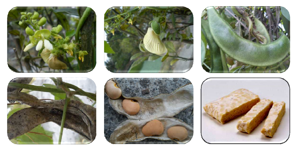
Fig. 1. Common climbing beans from young pod to matured seeds which can be used as vegetable, old seeds may be processed into tempeh mixed or supplemented with soybean.

Tempeh : This is a soy product that orginated form Indonesia. It is made from whole soybean seeds which are soaked, dehulled and partly cooked. Spores of Rhizopus oligoporus , used a s fermenting culture is mixed with the seeds. The seeds are spread thinly on a tray and allowed to ferment for 24 to 36 hours at 30<sup>o</sup> C. Good tempeh is characterized by proper knitting together to have a firm texture. This can be cut, soaked in brine or salty sauce and then fried. Tempeh has also been processed from other types of beans or mixture with whole grains. Figure 1 shows the pod of climbing beans, the mature seeds and the processed beans made into tempeh .