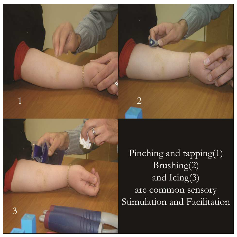
Fig. 1. Sensory stimulation and facilitation by Reza S Roghani, Rehabilitation University, Tehran, Iran

or an art, it is usually necessary to become familiar with some proprioceptive tasks specific to that activity.