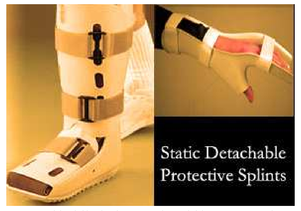
Fig. 2. Static and detachable splints by Reza S Roghani, Rehabilitation University, Tehran, Iran

Static and detachable splints [fig2] is useful mechanical devices to give rest to the paralyzed muscles and joints, preventing overstretching and shortening and to allow exercises and other therapeutic methods to be given regularly for preventing complications of continued immobilization.[16]