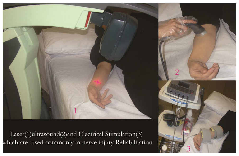
Fig. 4. Common modalities in nerve injury rehabilitation by Reza S Roghani, Rehabilitation University, Tehran, Iran

The insensitive joints and ligaments and other surrounding tissues which are affected by the injury to all or some supplying nerves are at the risk of stiffness, shortening and finally contracture. Regular daily massage, passive motion in full range at least one time per day and protective detachable static splints could prevent these complications. In case of joint stiffness dynamic splints and physical modalities such as ultrasound and laser [Fig4] will help to regain the softening and range of motion. [19]