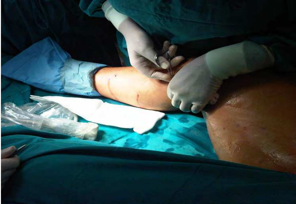
Fig. 2. Ancillary ambulatory phlebectomy performed immediately after the EVLA procedure