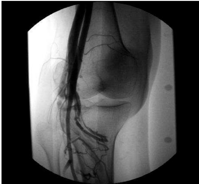
Fig. 5. Popliteal stage arteriography depicting an AV fistula between branches of the popliteal artery and a genicular vein after an EVLA procedure.

There are some case reports in the literature of an arteriovenous fistula between a small popliteal artery branch and the SSV (Vaz et al 2008). Although thought to be related to a heat induced injury caused by thermal energy from the laser device, an arteriovenous fistula could be caused by a needle injury during tumescent anaesthetic administration. To minimize the risk of these arteriovenous fistulas is necessary a careful advancement of the intravascular devices, atraumatic delivery of the tumescent fluid, the use of adequate amounts of tumescent fluid and the subfascial portion of the SSV where the popliteal artery branches exist, should be avoided. (figure 5).