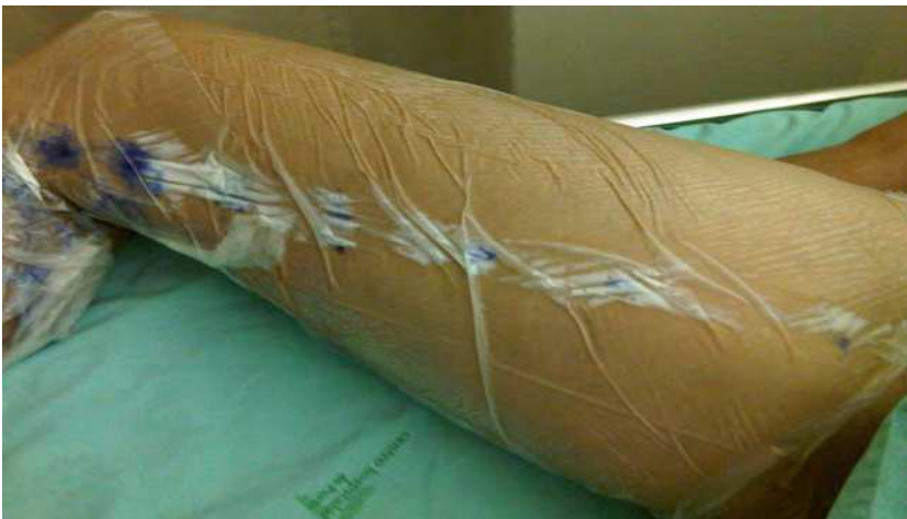
Fig. 1. Pre-operative marking of the vein, topic anesthetic on the length of the vein being treated

Duplex ultrasound has become the reference standard in assessing the morphology and hemodynamics of the lower limb veins. Preoperative duplex planning for EVLA is extremely important in order to avoid potential complications. Almost all modern ultrasound scanners used for imaging peripheral venous disease should be suitable for preoperative imaging and for guiding endovenous procedures. Typically linear array transducers with a frequency in the range of 5-12 MHz are suitable. During this examination it is important to evaluate the anatomy and the physiology of both the superficial and deep venous systems. EVLA is a good treatment option for eliminating reflux in a straight superficial venous segment. Indications for ablation include reflux in a truncal vein of a duration greater than 0, 5 seconds, that is responsible for patient symptoms or skin changes. Measurement of the vein diameter should be carried out during the course of pre-operative ultrasound for the calculation of the appropriate energy density. The duplex ultrasound inclusion criteria for this treatment are: veins with a 2mm or more diameter but preferably with 3mm or more and a treatable length of at least 10-12 cm. The course of the saphenous vein, from the saphenofemoral or saphenopopliteal junction to the insertion site is mapped by ultrasound. An indelible marking pen is used to mark incompetent sources of venous reflux under duplex ultrasound guidance before the procedure (figure 1).