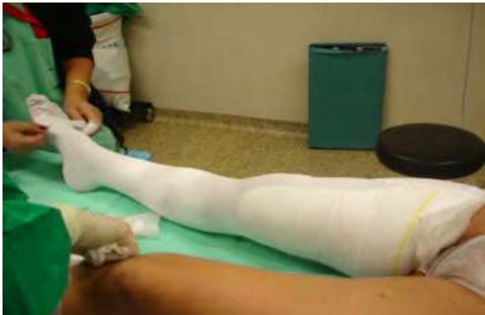
Fig. 3. Graduated compression stockings placed at the end of the procedure