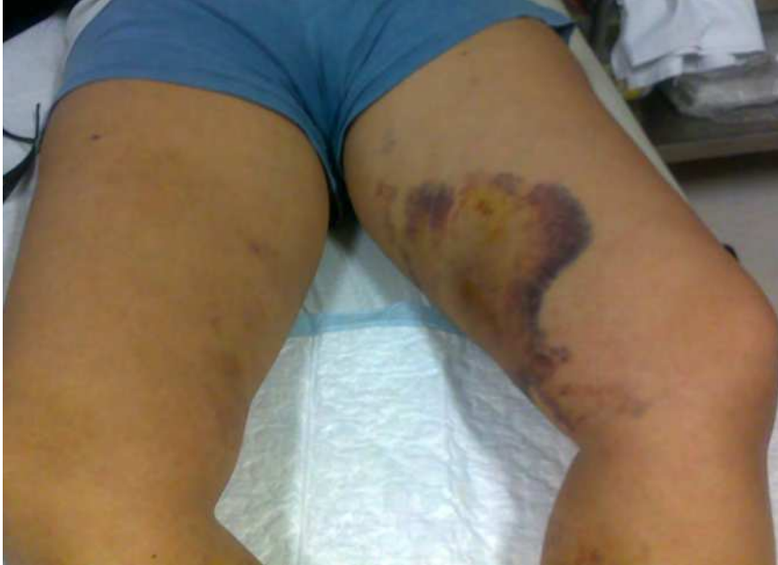
Fig. 4. Ecchymosis on the left lower limb after a bilateral EVLA procedure

Skin burns following EVLA have been reported but are relatively rare and seem avoidable with adequate tumescent anesthesia.