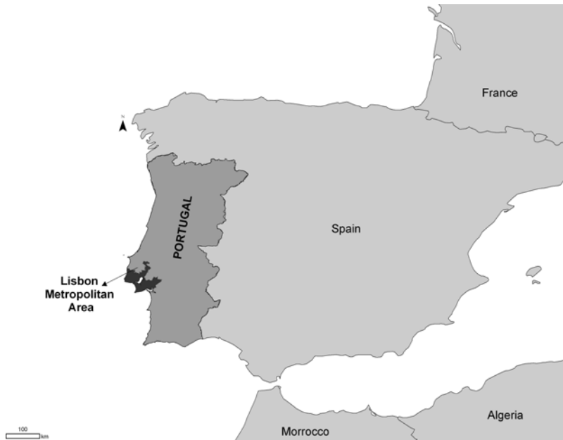
Fig. 1. Lisbon Metropolitan Area, Portugal