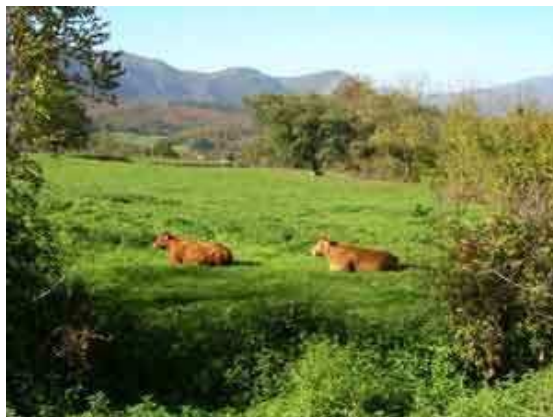
Fig. 2. Landscape of the studied area

In this studied area, in the northern sector, the winters are cold and humid and the summers are cold. Vegetation under Atlantic influences consists in oakwood and beechwood, with brushwood. In the southern sector is submediterranean and shows similar winter but hottest summers. Vegetation consists in gall-oak groves and holm-oak wood, being brush scarce (Roman et al., 1996; Dominguez, 2004). Mean summer temperatures in this area range between 16 and 20°C, while mean winter temperatures range between 2 and 5°C. Rainfall is usually high in winter at some 900-1100 mm/year. Altitude is ranging between 600-800 meters on the plateau. Climatic differences among different areas of Spain are responsible of both, the diversity of tick species and the circulation of tick-borne pathogens.