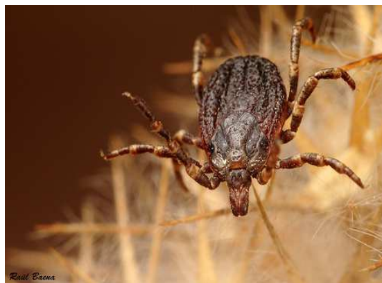
Fig. 1. Adult of Hyalomma lusitanicum

In this sense, Genus Hyalomma is a phylogenetically young group of ixodid ticks. As proposed Kolonin (2009), domestication and the development of cattle-breeding stimulated the evolution and biological progress of this group. These transformations continue to this day, as is apparent from the great number of intraspecific forms. Hyalomma ticks (Figure 1) are medium to large sized, with prominent mouthparts. Most species are 3 hosts, but there are also 1 and 2 hosts. Some species of this genus can use 1, 2 or 3 hosts to develop according to the host they found. The life cycle can last between 3-4 months and more than a year, depending on species and climate. The nymphs and adults stay overwinter in cracks and crevices between the stones of walls and barns, or uncultivated grasslands. Adults are found throughout the year, although the parasite load is higher in spring and summer, parasitizing deer and wild boar. Larvae and nymphs parasitize rabbits and are more prevalent in spring. Though this genus is usually restricted to the Mediterranean region, one of the species, Hyalomma lusitanicum , Koch 1844 ( Ixodoidea: Ixodida ) has a widespread distribution in some regions of Southern Spain, from which is introduced by wild animals (Encinas-Grandes, 1986).