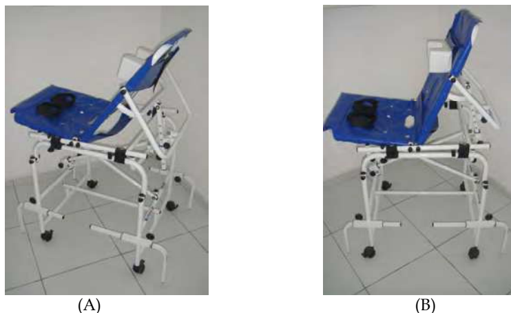
Fig. 6. Youth bath chair: (A and B) Removable base with height adjustment and belt and headrest system.

Other bath chair models (Figures 7 and 8) are designed to serve severe motor impairment users also have similar aspects, differentiating in some structural features, design and accessories. They are products whose tubular structure is often made of aluminum and the seat and back set consists of a polyurethane shell form-fitting, with or without holes, whose function is let the water flow during bath or shower.