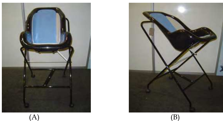
Fig. 8. Bath chair: (A) anterior view; (B) side view.

The bath chair presented in Figure 8 is a device produced by a small business, made of painted steel, with a seat and back system made by a plastic sheet and non-slip fabric. It has an "X" locking system concerning its width, while its length remains unchanged after being closed. As it is a tailored-made product, it is possible to get it according to the user measures, caregiver height and dimensions of the environment in use. The presence of foot casters for favoring moving is optional, although, because the seat and backrest are fixed, it is often necessary its transportation to be dried and cleaned.