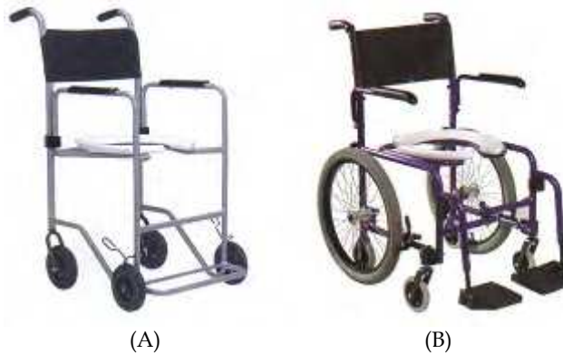
Fig. 3. Adult aluminum shower bath chairs: (A) Fixed structure and (B) Folding structure for closing.

the position of the head against gravity; moreover, the bending system of the seat and back group ("tilt") of up to 35^\circ allows a better accommodation for a person with absent or insufficient trunk control, who are unable to remain seated without support.