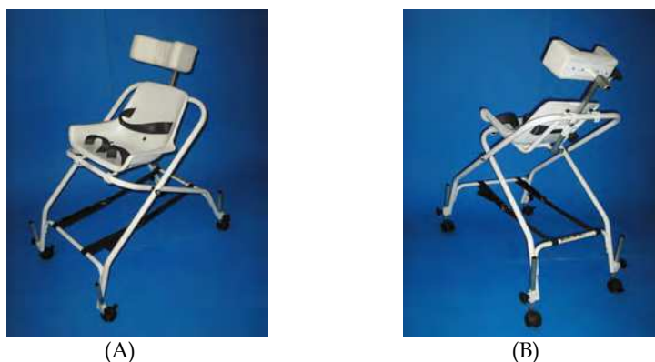
Fig. 7. Infant bath chair: (A) anterolateral view; (B) posterior-lateral view.

Other bath chair models (Figures 7 and 8) are designed to serve severe motor impairment users also have similar aspects, differentiating in some structural features, design and accessories. They are products whose tubular structure is often made of aluminum and the seat and back set consists of a polyurethane shell form-fitting, with or without holes, whose function is let the water flow during bath or shower.