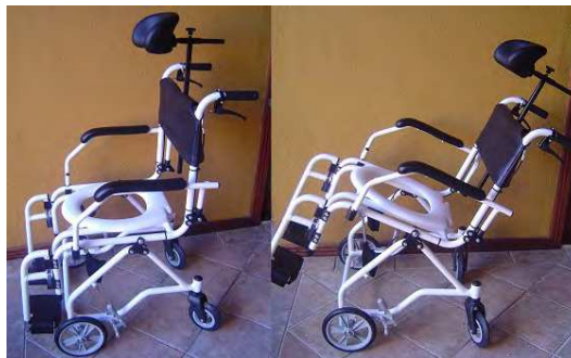
Fig. 4. Aluminum bath chair with backrest and headrest tilt system.

The presence of arms and legs support, which might be retractable or removable, supplement the necessary resources that permit a better accommodation of the user. Although the equipment presents more adequate features, the needs of more severely compromised people in the physical aspect, and the possibility of changing the adult toilet seat to a child one, implies that the dimensions offered by the equipment makes its designation more appropriate especially to adults.