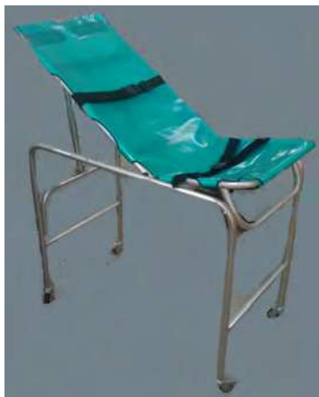
Fig. 5. Bath chair with recline tilt system.

Among these AT devices aimed for bathing or showering that have specific features to the demands imposed by more severely handicapped users, there are other models whose dimensions meet more specifically children and teenagers. These models, in their own constitution, usually have a range of resources appropriate to meet some specification, such as lack of motor control, including absence of neck control, insufficiency or default of trunk control, persistency of primitive reflexes and/or involuntary movements difficult to control, a situation that is compatible to people that with cerebral palsy or other disease that seriously compromise the musculoskeletal system.