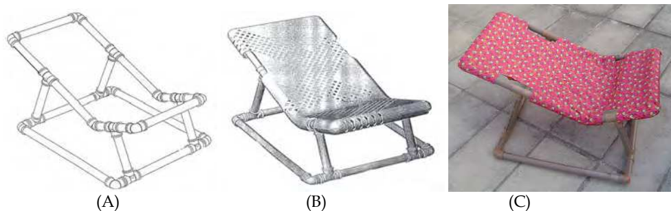
Fig. 10. (A) and (B): PVC pipes and connections structure; (C) Final craft model.