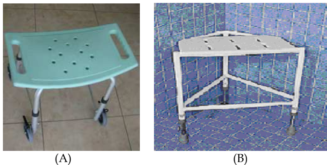
Fig. 1. Models of stools: (A) Four support stool with height adjustment; (B) Edge stool with adjustable height.

The more commonly available equipments to help a person who needs support to remain sitting during shower or bath because of temporary or permanent motor commitment. There are many models in the market which can be made specifically for this purpose, as well as other ones that are available for other purposes but adapted for such task. Most of the conventional models are made of plastic with rubberized coating with variations in their design in relation to the model and dimension of the seat and backrest, armrest and variation in height (Figure 1 and 2).