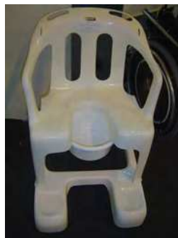
Fig. 2. Chair with cut out seat.