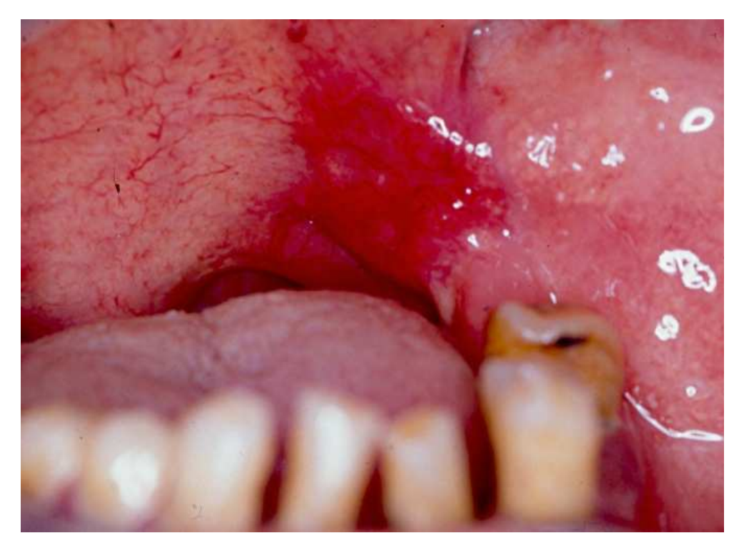
Fig. 1. Erythroplastic oral squamous cell carcinoma.