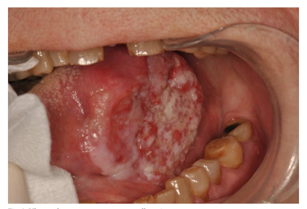
Fig. 3. Ulcerated-type tongue squamous cell carcinoma.

Ulcerated-type oral squamous cell carcinomas are usually diagnosed at stages III or IV (Jaulerry, 1985) (Figure 3). Although the predictive value of the clinical appearance of the primary lesion remains controversial, it is accepted that ulcerated lesions imply poorer survival rates (Jaulerry, 1985).