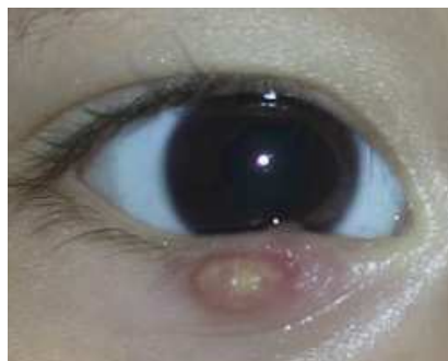
Fig. 5. Stye at lower eyelid

Congenital ptosis is the most important disease of the eyelids in a child. It is usually unilateral and occurs sporadically in most cases. The underlying pathology is the dysplasia of the levator palpebralis muscle. Surgical correction during the preschool years must be performed. If the disease is severe, early surgery to prevent amblyopia may be performed.