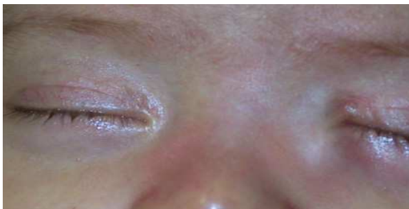
Fig. 2. Left dacryoceles

Amniontocele (congenital dacryoceles), punctual atresia or fistulae between the sac and the skin are other rare etiologies for epiphora. Amniontocele is characterized by a blue-green distention of the lacrimal sac, observed externally at the level of inner canthus. It is due to an imperforate valve of Hasner. Amniontocele is mostly self limiting within a few days of birth, especially if massage is applied (Rose, 2000).