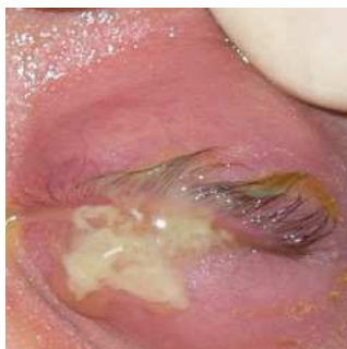
Fig. 7. Gonococcal keratoconjunctivitis

Staphylococcus aureus, staphylococcus epidermidis, and streptococcus pneumonia are the most common organisms that cause infectious keratitis. Bacterial keratitis usually occurs in patients with damaged corneal epithelial integrity. However, Neisseria gonorrhoeae, Corynebacterium diptheriae, Listeria and Haemophilus species may lead to keratitis in the presence of intact epithelium. Bacterial keratitis is characterized by oval shaped corneal infiltrations surrounded by corneal edema, conjunctival hyperemia (injection), ocular pain and photophobia.