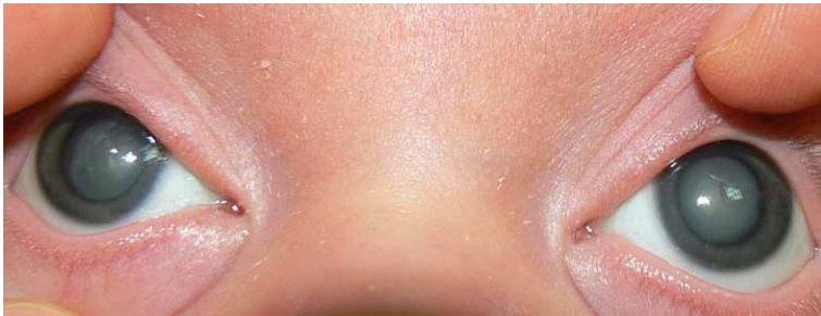
Fig. 3. Bilateral congenital cataract

Cataract is the opacification of the crystalline lens. Cataracts result from protein denaturation, increased molecular weight of proteins, water vesicles between lens fibers, increasing proliferation and migration of the lens epithelium. Childhood cataract occurs worldwide and is an important cause of childhood blindness in many countries. Congenital cataracts occur in about 3 in 10 000 live births. Two-thirds of cases are bilateral. The cause of the cataract can be identified in about half of the cataractous eyes. Unilateral cataracts are usually isolated sporadic incidents, without a family history or systemic disease and effected infants are usually full-term and healthy. Cataract can be associated with ocular abnormalities, trauma, or an intrauterine infection such as rubella. Bilateral cataracts are often inherited and associated with other diseases. They require a full metabolic, infectious, systemic and genetic workup. The common causes are hypoglycemia, trisomy (eg, Down, Edward and Patau syndromes), myotonic dystrophy, infectious diseases (eg, toxoplasmosis, rubella, cytomegalovirus and herpes simplex [TORCH]) and prematurity. Isolated hereditary cataracts account for about 25% of the cases. The mode is most frequently autosomal dominant, but may be autosomal recessive or X-linked (Mickler, 2011).