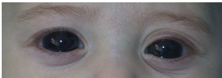
Fig. 4. Buphthalmos in PCG

Primary congenital glaucoma (PCG) is the most common reason for raised intraocular pressure in child. It occurs in 1:10000 births and more commonly in boys. 75% of the cases are bilateral. Although autosomal recessive cases have been described, most cases of PCG are sporadic. Glaucoma develops due to the anomalous development of the anterior chamber angle. Raised intraocular pressure, cloudy cornea, large appearance of the eye (buphthalmos), optic nerve alterations due to high intraocular pressure and special biomicroscopic signs are diagnostic features of PCG.