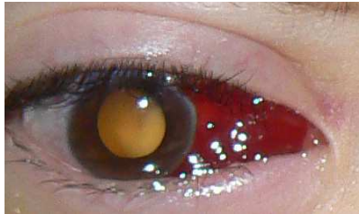
Fig. 8. Leukocoria due to RB