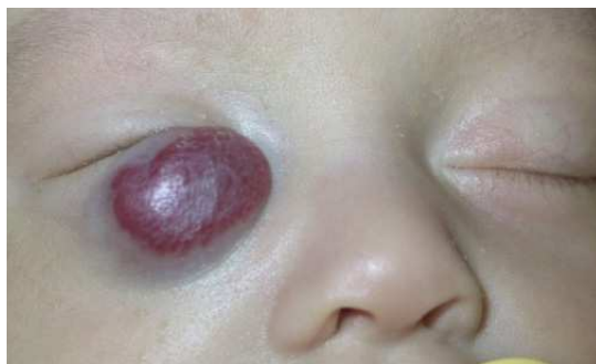
Fig. 1. Capillary hemangioma

Infantile hemangiomas are the most common eyelid tumors in infancy. They have a bright red or purple appearance. Superficial ones typically blanch with pressure. At birth, they may be clinically undetected. However, they typically enlarge in the first 12 months followed by a slow involution during the first decade. Vision loss is related to amblyopia because of induced astigmatism or visual deprivation due to ptosis. Steroid treatment (intralesional and/or oral) is the first line of therapy (Levin, 2003).