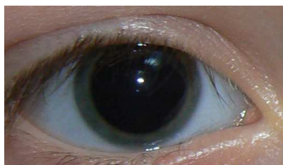
Fig. 9. Blue sclera in a case of EDS

Angioid streaks (blood vessel-like) and visual loss may occur in pseudoxantoma elasticum