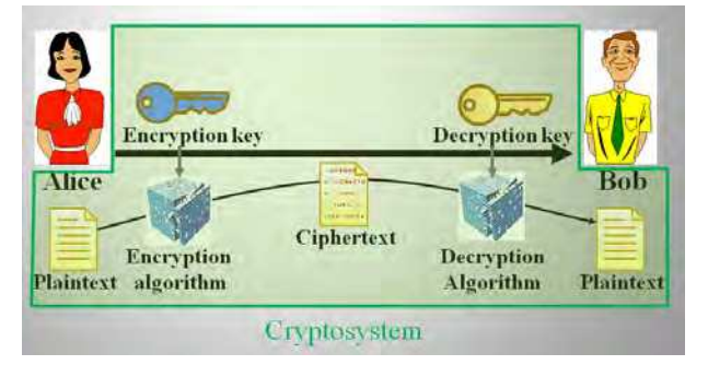
Fig. 1. General structure of a cryptosystem

A cryptosystem S (symmetric case) is defined as the set of an encryption/decryption algorithm E , a secret K , a plaintext message P and a ciphertext C . Let us recall that in the case of asymmetric cryptography (also well-known as public-key cryptography), the decryption and encryption algorithms are different, as well as the encryption and decryption keys. Asymmetric cryptography is mainly used for authentication and digital signature purposes but it can also be used to encrypt small quantities of information (a few dozen bytes). On the contrary, in the symmetric case, the key K and the algorithm E are the same. Symmetric cryptography is considered for encryption purposes. The plaintext is supposed to be secret while the cipher text is supposed to be accessed by any one. So with those notations, we have