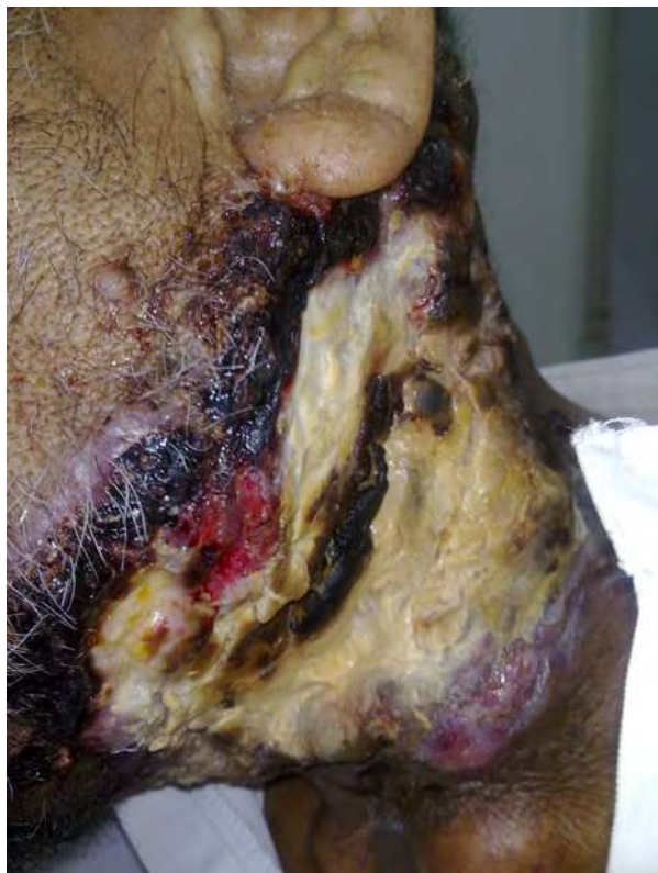
Fig. 1. Wound infection and necrosis

on the SCM during flap elevation, and the decision of whether to preserve it can be made later. Sacrifice of this nerve during neck dissection leads to a sensory deficit of the auricle that usually diminishes with time. Neuroma of divided greater auricular nerve can occur(10).