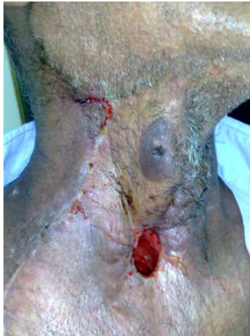
Fig. 2. Pectoralis major flap for coverage of exposed carotid artery

Complications involving the common carotid artery are the most feared sequelae of neck surgery. Acute postoperative carotid artery rupture, or "blow out" occurs in 3% to 4% of radical neck dissection and associated with a mortality rate of 50%. Factors associated with carotid artery hemorrhage include wound breakdown, necrosis, and infection, pharyngocutaneous fistula, prior radiation therapy, tumor involvement of the arterial wall. Tumor invasion of the carotid artery is a relatively uncommon event of advanced aggressive disease or revision surgery for a recurrent neck mass(4).when wound dehiscence results in the exposure of the carotid artery,it is more ominous, and its management more critical.(fig2)