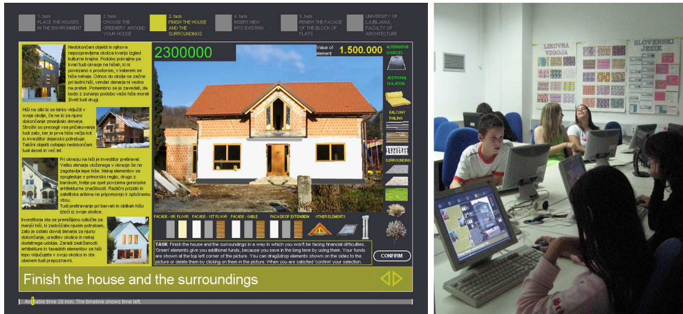
Fig. 2. Eco-spatial Education Interface (task#3 and the classroom setting).

interactivity of tasks (visual feedback, reversibility of actions, experimenting). Conditions ranged from maximum to minimum interactivity, from traditional face to face (f2f) education method to the test group (which did not receive any information and educational contents, just the task and basic instructions). Several parameters were automatically recorded (i.e. time, user choices, etc) and results of each task graded. The technical requirements for running the application and its IT scope were intentionally scaled down to match the IT equipment in schools (no installation required, application runs even on slow computers).