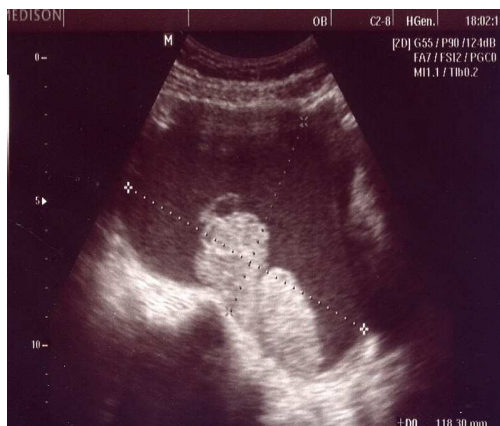
Picture 1. Transabdominal ultrasonography of 44 year-old, single woman with palpable pelvic mass has shown mixed solid cystic mass sized 11.8 cm. Postoperative pathologic diagnosed clear cell adenocarcinoma of ovary, FIGO stage IC.

ovarian cancer. A number of tumor markers were detected only in late staged of cancer as shown in table 3.