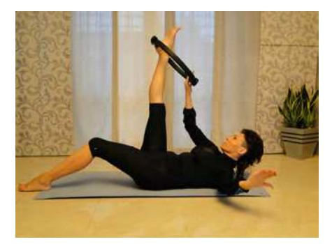
Fig. 1. Multidimensional exercise with Pilates circle

Exercises on professional Pilates' devices are mainly resistance exercise performed with the aid of springs and pulleys, but also stress relief of certain parts of the body can be achieved. The machines can be customized to the needs of the practitioner. The resistance during the exercise allows movement to be isolated and performed in the proper plane. Additional resistance prevents automatic movements being responsible for injuries. The exercises using professional Pilates' devices can be performed in post-acute state of sports injuries.