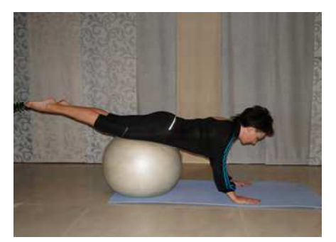
Fig. 9. Push-up exercise on Swiss ball, starting position without "locked elbows"