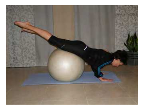
Fig. 10. Push-up exercise on Swiss ball, movement with activation of strong core

It was found that the upper trapezius and serratus anterior are under differing cortical control mechanisms, with trapezius but not serratus demonstrating both contralateral and ipsilateral responses to cortical magnetic stimulation. Increased upper trapezius tone and constant readiness to activate disturbs the humero-scapular rhythm and is also an indication of fatigue or compensation of serratus anterior. As muscle fatigue can be a central phenomenon as well as a peripheral phenomenon, the upper trapezius may have been recruited differently during or after the task. (Alexander et al., 2007, Hunter et al., 2006 as cited in Szucs et al., 2009) It is ball, important that performing Pilates Push-up, which is an exercise in close kinematic chain, serratus anterior muscle should be activated rather than a dominant role of upper trapezius muscle which can be achieved by the alignment of spine, unlocked elbow joints, lower – costal breathing and touching stimulus of an instructor during execution of an exercise.