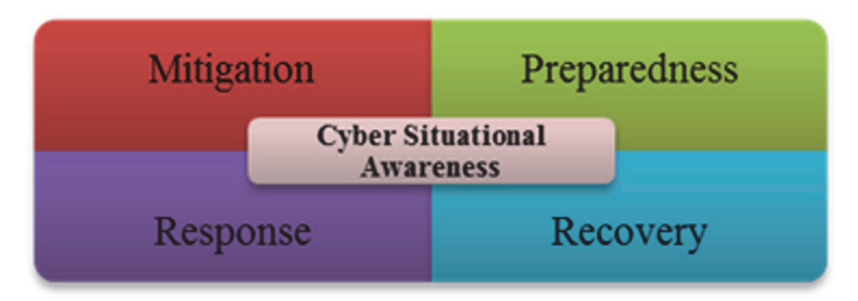
Fig. 1. Cyber Situational Awareness for Emergency Management.

Since all EM tasks fall within the following categories: mitigation, preparedness, response and recovery (Dudenhoeffer et al., 2007), each is impacted by cyber situational awareness as listed in figure 1.