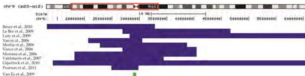
Fig. 1. Schematic overview of the associated regions found by linkage studies and GWAS.

Since this initial report several other GWAS in ALS patients have replicated the association to chromosome 9p21.2. In a GWAS performed on 405 Finnish ALS patients, of whom 93 patients had fALS, and 497 control individuals two association peaks were identified (Laaksovirta et al., 2010). One peak corresponded to the autosomal recessive D90A allele of the SOD1 gene. The other was identified in a 232-kb LD block on chromosome 9p21.2. The association signals in this study were mainly driven by the 93 fALS patients. A 42-SNP risk haplotype across the chromosome 9p21 locus was shared between 41 fALS cases with an odds ratio of 21.0 (Laaksovirta et al., 2010). In another GWAS in an ALS cohort from the UK