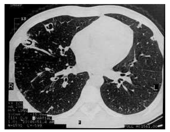
Fig. 3. Computed tomography scan showing peripheral cavitary nodules with thick irregular walls from 1 to 3 cm of size

In many instances, these radiological findings precede the clinical manifestations of IE. Also, the follow up of septic emboli could be performed by computed tomography.