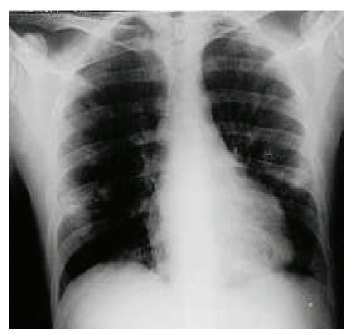
Fig. 1. Chest X-ray showing bilateral opacities and nodules, corresponding to septi emboli