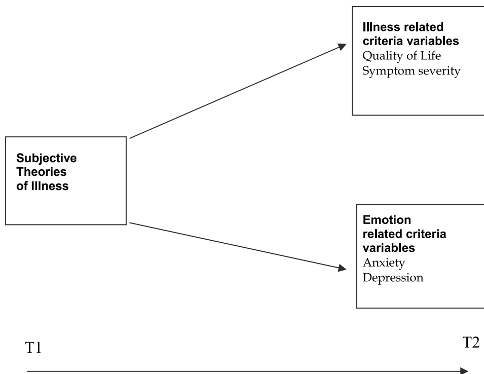
Fig. 1. Adaptation of the Common Sense Model of Illness Representation by Leventhal et al. (1980); Hagger & Orbell (2003)

This study is based on an adaptation (Figure 1) of the Common Sense Model of Illness Representation by Leventhal et al. (1980).