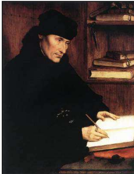
Fig. 1. Quinten Metsys, Portrait of Erasmus of Rotterdam, 1517. Oil on panel, 59 x 46.5 cm. Reproduced with permission from National Gallery of Antique Art, Rome.

Analysis of the hands in the Flemish paintings and works attributed to Peter Paul Rubens seems to show hand lesions resembling those of rheumatoid arthritis. To illustrate this, on the reproduction here, swelling of three metacarpophalangeal joints are clearly visible on the right hand of Erasmus of Rotterdam painted by the Flemish Quinten Metsys in 1529, (FIG.1). Desiderius Erasmus (1467-1536), the Dutch renaissance scholar is often quoted for his famous aphorism "prevention is better than cure" and is recognised as the Prince of Humanists for his progressive writings of the time. This painting is testimony to the high cultural climate of the time, and evidence of the links between two great humanist thinkers, Erasmus of Rotterdam and Sir Thomas More, both of whom contributed to the publication of Utopia.