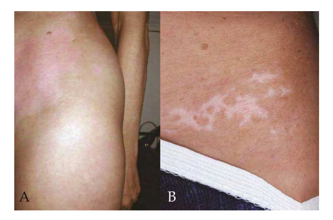
Fig. 4. A. Extensive vitiligo of the lower abdomen and hips. B. Repigmentation of vitiligo patches after 24 months of NB-UVB treatment.

Home UVB therapy may be a valuable and convenient option for select patients. Patientreported outcomes for home NB-UVB therapy and outpatient NB-UVB therapy revealed that they show similar clinical efficacy and safety profiles (Wind, Kroon et al., 2010). Home NB-UVB is convenient and can be cost-effective in certain situations. However, more reliable long-term follow-up data is needed to further justify home UVB therapy.