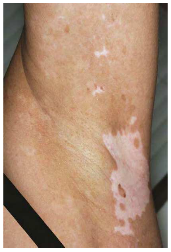
Fig. 6. NB-UVB is an effective treatment modality for vitiligo. Short term adverse effects are primarily related to phototoxicity. Long-term carcinogenic risk may not differ greatly from the general population.

When comparing UVB and PUVA carcinogenic risk, a single PUVA increases risk 7 times more than a single UVB treatment (Lim and Stern, 2005). Even with a history if PUVA therapy, patients who had less than 300 treatments of UVB had no appreciable increase in NMSC risk (Lim and Stern, 2005). Available data on NB-UVB therapy has not consistently identified a significant increase in NMSC when compared to the general population (Table 4). The majority of follow-up data was primarily taken from Caucasian populations, but the same conclusion has been drawn in non-Caucasians with skin types III-V (Jo, Kwon et al., 2010). An increased risk of BCC was noted in two Scottish studies, one with NB-UVB monotherapy, and the other with a history of both NB-UVB and PUVA usage (Stern and Laird, 1994; Man, Crombie et al., 2005). However, the temporal relationship between tumor diagnosis and phototherapy makes a relationship between therapy and cancer unlikely in either study (Stern and Laird, 1994; Man, Crombie et al., 2005). In addition, it is common to use topical pimecrolimus and/or tacrolimus as adjuncts to NB-UVB. Topical pimecrolimus and tacrolimus have not been found to increase risk of NMSC in adults. Therefore, even in combination with NB-UVB, there should be no cumulative carcinogenic effect. Therefore, UVB, in particular NB-UVB, may be the phototherapy option with the least carcinogenic risk in all skin types.