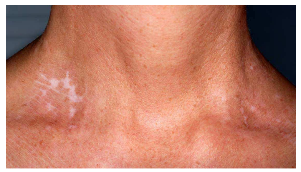
Fig. 2. Near complete repigmention of vitiligo patches with NB-UVB treatment.