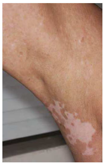
Fig. 5. Amelanotic patches of vitiligo in flexural areas undergoing involution NB-UVB therapy.