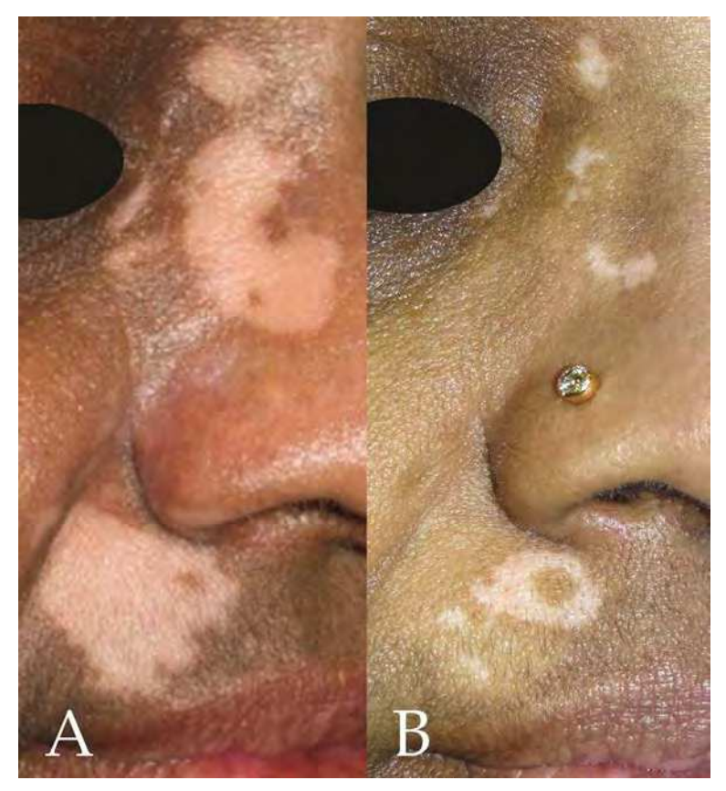
Fig. 3. A patient with facial vitiligo was treated with NB-UVB phototherapy three times weekly. A. The patient prior to initiating treatment. The patient was then started at 200 mJ based on standard protocol for Fitzpatrick skin type III. B. The patient with notable repigmentation after treatment 56 at a dose of 1001 mJ.

NB-UVB for vitiligo is most effective on the face and neck, followed by the trunk, and then upper extremities (Figure 3). Acral regions including the lower extremities, palms, and soles are more resistant to treatment. The reason has yet to be elucidated, but the regional density of hair follicles, which are reservoirs for melanocytes, are thought to play a role (Stinco, Piccirillo et al., 2009). In general, the repigmentation patterns in patients treated with NB-UVB are, in descending order, perifollicular (51.3%), then marginal, diffuse, and combined (Yang, Cho et al., 2010). However, the marginal pattern was observed to be the most common when >75% repigmentation occurred by 12 weeks of treatment (Yang, Cho et al., 2010).