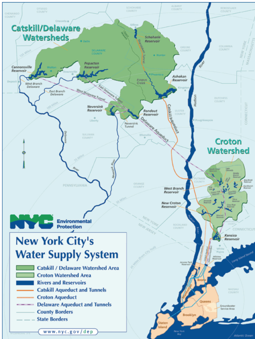
Fig. 1. New York City's Water Supply System

Within two years, two other efforts were completed in the city's favor: a successful campaign to obtain Congressional approval of the City's application to build the aqueduct