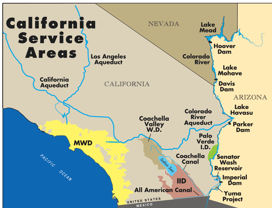
Fig. 2. City of Los Angeles' Water Supply System

regarding water management in Los Angeles itself, beginning in the 1970s. Continuing drought and unrelenting population growth compelled the city to embrace a more adaptive approach to water management reliant on conservation, drought management, and a balance between augmenting supplies while providing incentives to lower demands: a method termed integrated resource management . This approach came to rely on non-structural, incentive-based, and education-driven methods to reduce water use and has been facilitated in part by concerns over climate change as well as the stresses and strains felt throughout its water importing regions (Los Angeles Department of Water and Power, 2010a).