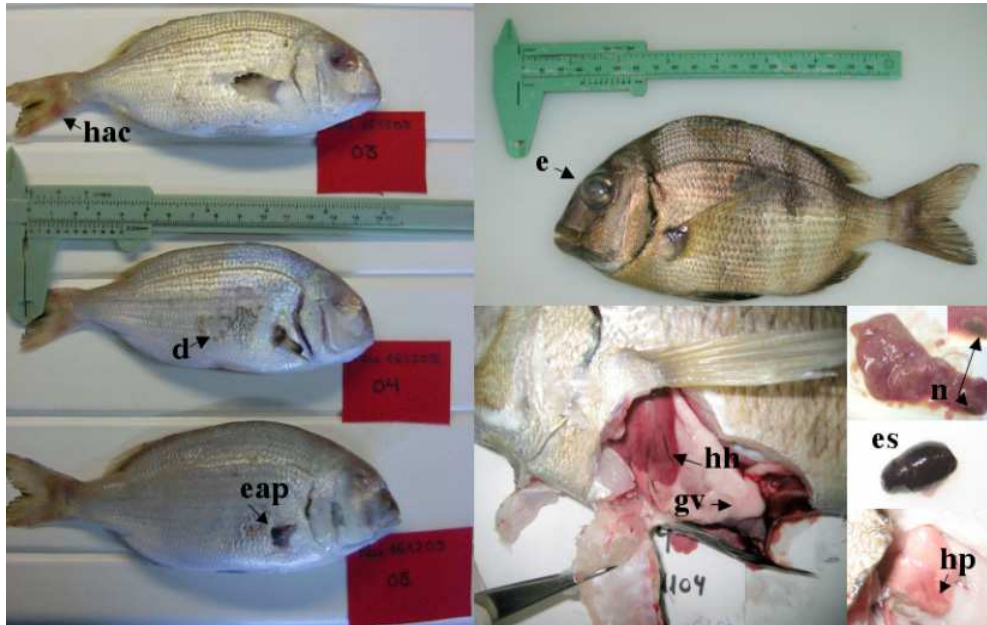
Fig. 1. Main external symptoms and pathological signs in the internal organs observed in affected fish. (hac) haemorrhages in caudal fin; (d) skin desquamation; (eap) fin erosion; (e) exophthalmia; (hh) haemorrhagic liver; (gv) visceral fat accumulation; (n) necrosis; (es) splenomegaly; (hp) petechiae.