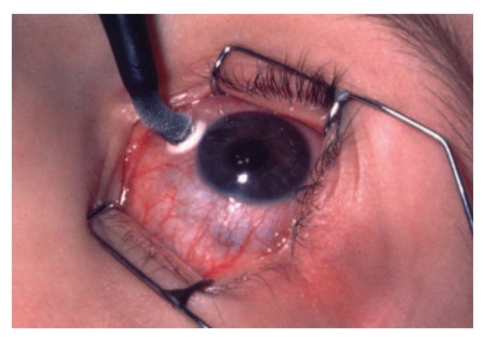
Fig. 1. Cyclodestructive procedures to relieve pain

at 3 and 9 o'clock. In all cases, the probe tips were carefully examined. The Diode laser handpiece attachment from one manufacturer is shown in figure 2. A strong topical steroid is prescribed hourly on the day of treatment and then q.i.d. for 2 weeks. Oral non-steroidal anti-inIlammatory agents are prescribed for 2 days. Figure 1 showed cyclodestructive procedures to relieve pain. Figure 2 showed Semiconductor Diode laser. Figure 3 showed "G probe" handpiece for contact Diode TCP.