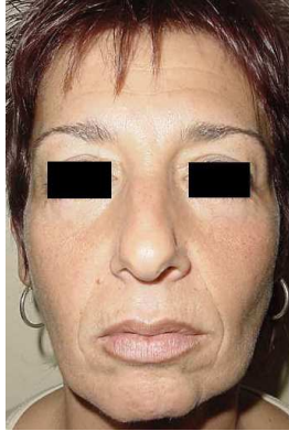
Fig. 5. Frontal view of the patient before treatment