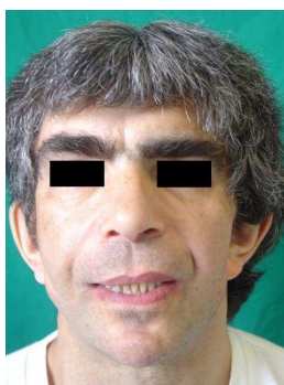
Fig. 10. Frontal view of the patient after treatment

Radiological and clinical exams with Computer Tomography Dental Scan and Telecranium x ray in two projections with cephalometric study were performed to evaluate bony and soft tissues. After 1 month surgery was performed: two fixtures with abutment have been positioned in the right mastoid bone, Then the left auricular was positioned to reestablish the normal structures of the face. In the same surgical time, two porous polyethylene prosthesis were implanted in the malar region, to restore the sagittal diameter of the middle third of the face; other two porous polyethylene prosthesis were implanted on the mandibular angle and one more prosthesis was implated on the sinphisis, to restore the transversal and sagittal diameter of the third inferior of face. After three mounths an auricular prosthesis associated to Polyacrylamide implant, was positioned in bilateral pre-auricular area ( FIGURE 10 ). Clinical and radiological follow-up demonstrated a good integration of implants and the biomaterial.