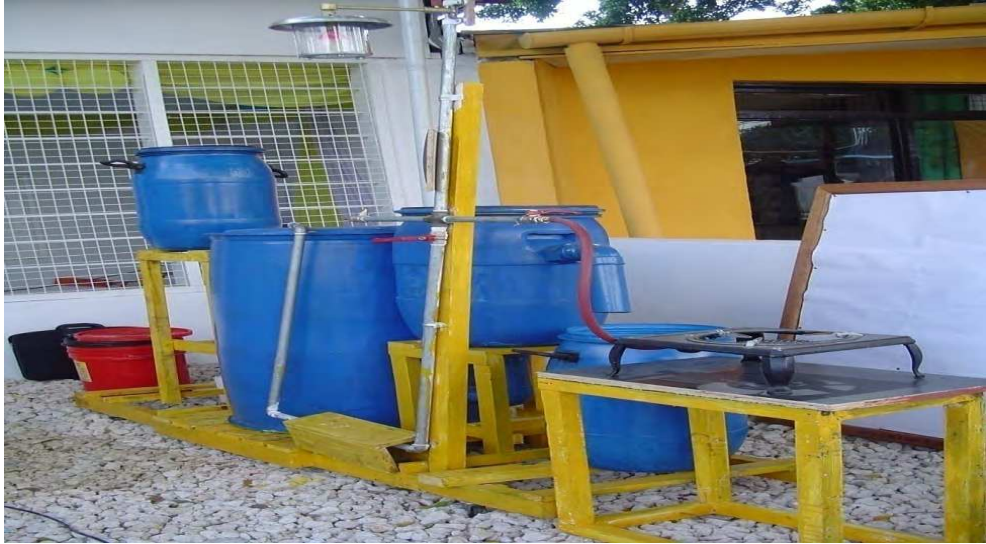
Fig. 4. A biogas plant using plastic containers

Organisation (SIDO), GAMARTEC, VETA, and private enterprises are researching and developing biogas plants for domestic and institution applications.