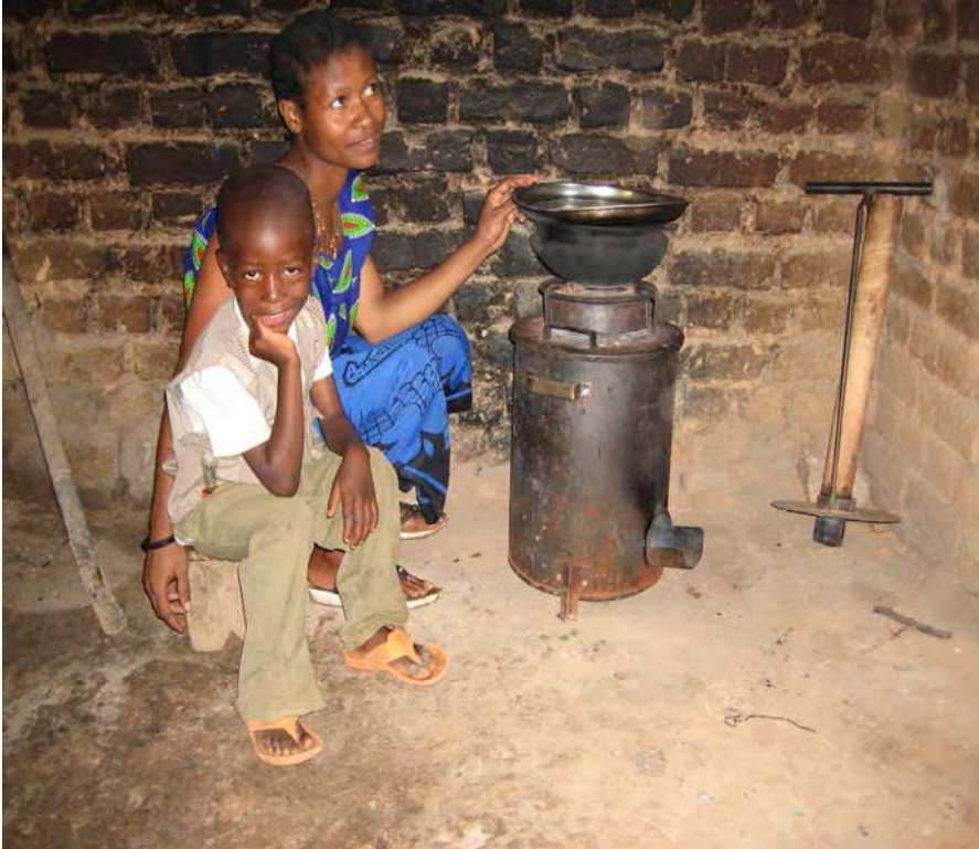
Fig. 7. Sawdust stove in Rural Tanzania