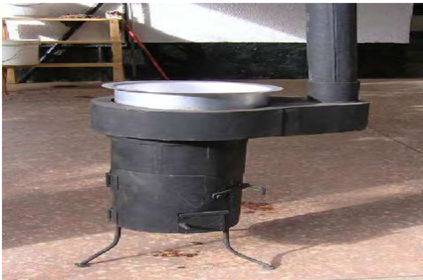
Fig. 5. Jiko Mbono Underdevelopment

Other benefits are income generation opportunities especially to village technicians. Stove improvement technology adds value on indigenous technology that uses indigenous fuel resources and material. Improved stove technology project is designed to start with small models that can be replicated in the whole country. The project will relate to construction of the efficient stoves and imparting knowledge on proper management of woodfuels. Amongst of the improved stove is " Jiko Mbono " shown in Figure 5. The stove is a Top-Lit-UpDraft (TLUP) gasification stove with natural draft air supply. The stove can use Jatropha seeds directly instead of Jatropha oil.