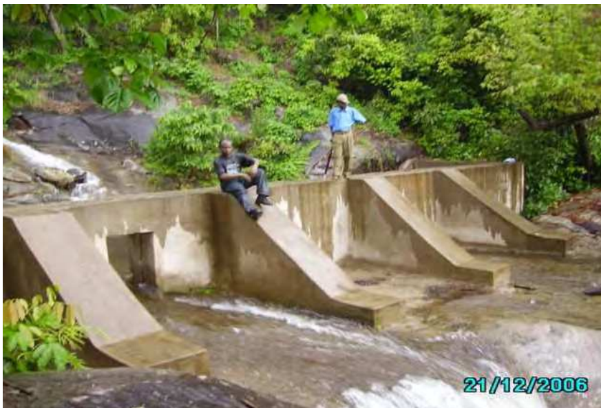
Fig. 3. Water falls for mini-hydro power at Chita-Kilombero