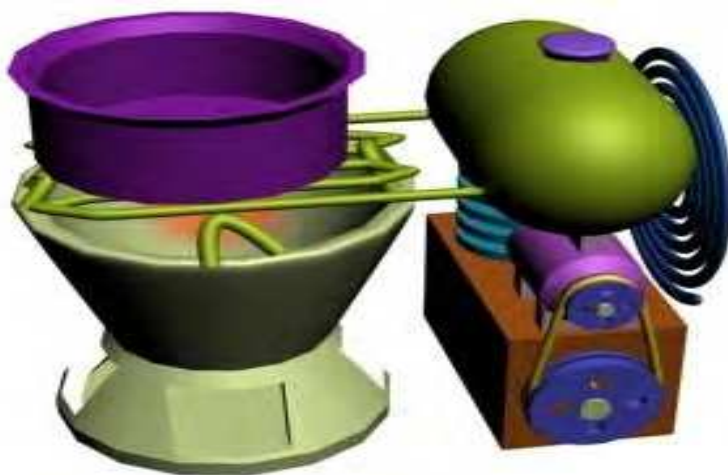
Fig. 9. The 3D Concept of the Steam -Electrical Generator Prototype

There is few biomass based-co-generation plants in the country. These include sugar processing plants: Tanganyika Planting Company (TPC), Kilombero Sugar Company (KSC), Mtibwa Sugar Estates (MSE) and Kagera Sugar Company, Tanwat (Tanning) and Sao Hill Sawmill have waste that can be used in generating electricity. Table 13 shows electricity generated from cogeneration technology.