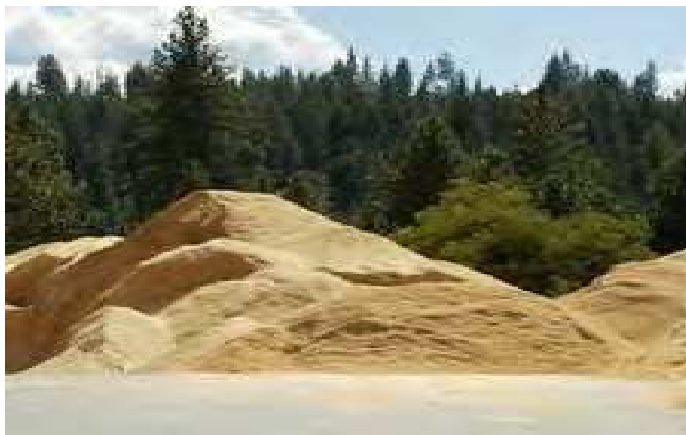
Fig. 6. Sawdust accumulation at one of Timber Processing Industry in Tanzania