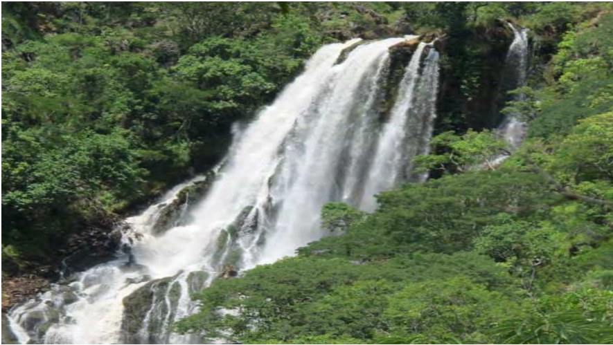
Fig. 2. Water fall at Madaba in South-Western Tanzania

Mbeya, Kigoma and Njoluma. Identified potential river sites for small hydro power generation are given in Table 12. Assessments of actual power available from the established sites are still being worked out. However, the established sites have the potential of generating enough electricity to spur rural electrification in the identified areas. Water falls from the identified area is shown in Figures 2 and 3.