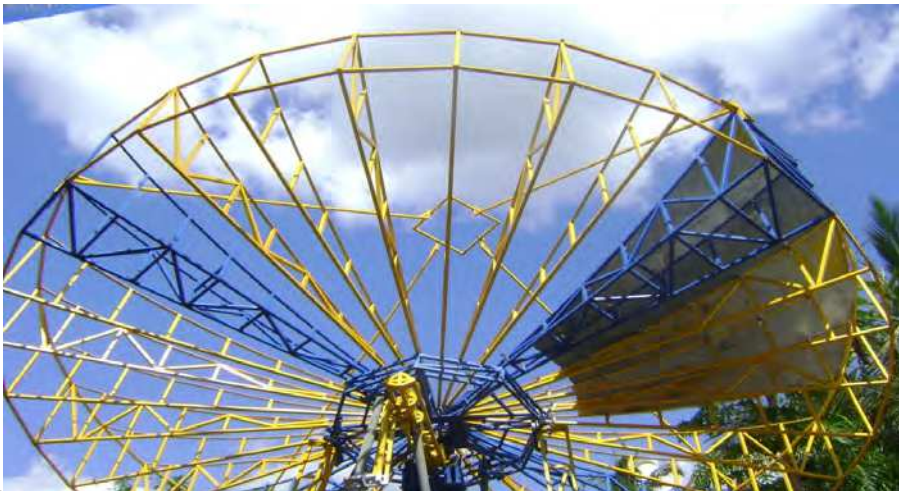
Fig. 8. A Parabolic Concentrator Heliostat