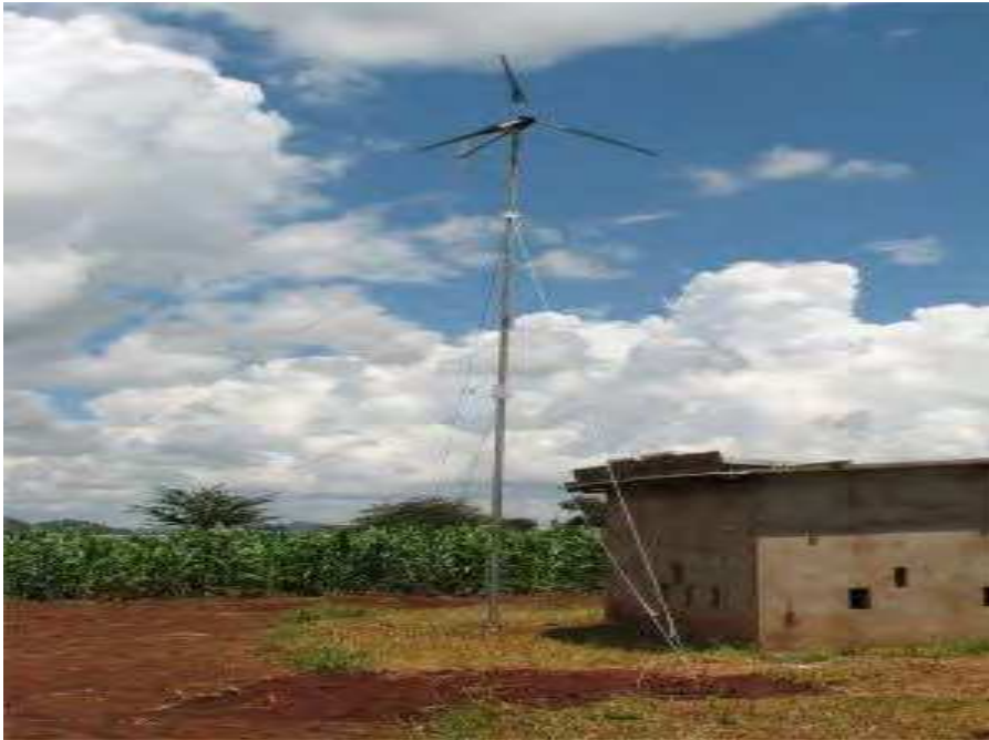
Fig. 1. Wind Turbine used to Generate Electricity for Water Pumping