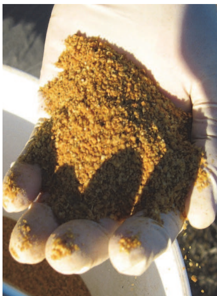
Photo 1. Typical sample of DDGS from ethanol production.

Over the past 15 years, dry-grind corn processing has become the primary method for producing ethanol in the U.S., favored over wet milling and dry milling (Rausch and Belyea, 2006; RFA, 2011). The simplified steps for making ethanol from corn using the dry-grind method are 1) mixing ground grain corn with water, 2) cooking the mixture and adding amylase enzyme, and 3) liquefying the mixture and adding glucoamylase enzyme and yeast for fermentation. The products of fermentation are ethanol, water, and solids. The solids, also referred to as “whole stillage”, are removed from the bottom of the fermentation unit and centrifuged to separate the solids into wet grains and thin stillage. The thin stillage is generally evaporated to form a thick syrup, which is added back to the wet grains. These wet grains are referred to as wet distillers grains with solubles (syrup) added, or WDGS. The final step of this process is to dry the wet grains to form DDGS with solubles (syrup) added, or DDGS (Rausch and Belyea, 2006).