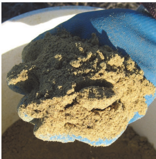
Photo 2. Typical sample of canola meal from oil-pressed canola seeds.

The main components used to make biodiesel are soybean or canola oil and an alcohol source, typically methanol. Seed meal byproducts are left after oil is extracted from soybeans and canola oil. While the methods used for extracting oil vary slightly between soybeans and canola seeds, oil is extracted from most oilseeds through a process of cleaning, drying, dehulling, size reduction, flaking, cooking, and tempering (Dunford). The most critical step of this process is cooking/tempering, which is also referred to as conditioning. During this step, oilseeds are cooked or tempered to denature proteins, which releases oil from the seeds and inactivates enzymes. Once they reach a specified temperature, cooked/tempered seeds are pressed to separate oil from the seed. The portion of seed solids remaining after this process is referred to as the meal. The oilseed meal can be used immediately as an animal feed without further treatment.