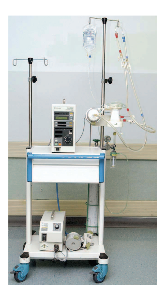
Fig. 2. The percutaneous cardiopulmonary support system used at our institution. It consists of a pump console, flowmeter, back-up console, and a holder for the centrifugal pump and oxygenator module with a drive motor. This system can be transported using a cart or clamped onto the bed. The emergency bypass system circuit, which consists of the centrifugal pump, oxygenator, and tubing, is sterilely packed.