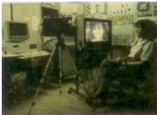
Fig. 4. Experimental Model: Simulated Public Speaking Test

One important example of such procedures is described in the study by McNair and colleagues (1982), who developed a clinical-experimental model of anxiety named Simulated Public Speaking Test (SPST), later modified by Guimarães, Zuardi, and Graeff (1987). The test, initially used to measure the anxiolytic effects of diazepam, consists of asking the subject to prepare a speech and present it in front of a video camera that records his performance (see Figure 4).