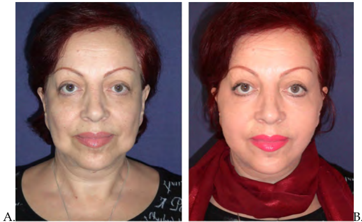
Fig. 8. A. Before, B. Result after cheek UAL. Change from square face into oval. The beauty triangle is achieved.

Optimally, patients should wear these 24 h/d for approximately 4 to 6 weeks (depending on summer or winter times and on flabbiness of the skin and tissue). In our geographic area compression will be advised for about a month in summer time, and for a month and a half in wintertime. It will reduce swelling and results will be visible more quickly.