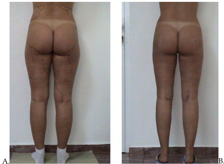
Fig. 1. A. Before, B. Result on day one after UAL of flanks, lower buttocks, outer and inner thighs, inner knees. Good effect of crus and leg elongation. Great loss of fat amount and minimal bruising.