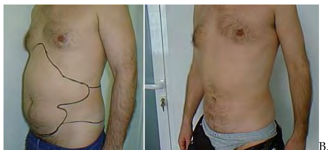
Fig. 6. A. Before, B. Result after 4 months after abdomen and flanks UAL. Loss of fat all around the body - visible loss of volume in the upper arm.