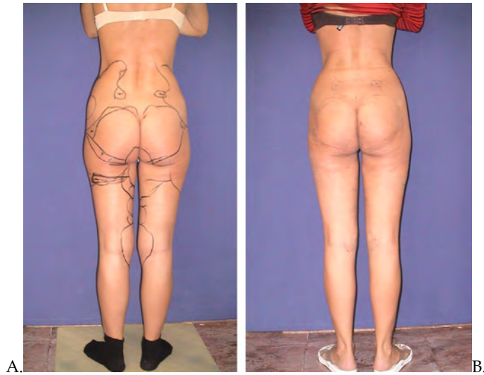
Fig. 2. A. Before, B. Day one after UAL of flanks, lower buttocks, outer thighs, inner thighs and inner knees and buttock lift by Serdev suture technique. Surgical markings from the previous day are still visible. Note the relative elongation of the crus and legs. Buttocks look smaller, rounded and at a higher position due to body proportions changes.