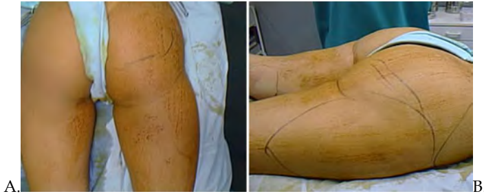
Fig. 4. A. and B. Left buttock reduced using UAL. Right buttock still not treated. Effect of buttock's lift on the left side in different patients using UAL. Visible lift of 3-5 cm of the infragluteal sulcus.