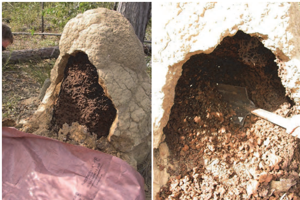
Fig. 2. Coptotermes acinaciformis mound displaying outer structure (7cm thick of 50% soil and 50% organic matter) with internal structure of ventilation space 1.5 cm and moist nest material with live termites.

We have described the network of short dead-end tunnels found in the irregular sponge-like outer walls of C. lacteus mounds that serve to 'trap' excessive moisture from within the mound, and so avoid moisture dripping down into the core of the mound. Furthermore, we hypothesize that this mound architecture allows rapid access to moisture for the colony members in times of prolonged drought and in order to carry out repairs and extensions to the mound. But, equally important, we suggest that this water source sustains their symbiotic micro-organisms (particularly actinobacteria) within the mound materials and within themselves (French & Ahmed 2010).