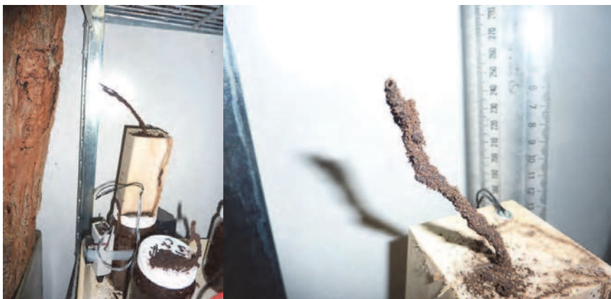
Fig. 1. Coptotermes termite constructing a bridge to reach food source in a laboratory set-up test Jars.

More recently, at an international conference at Arizona State University, USA, (18-20 February 2010), entitled 'Social biomimicry: Insect societies and human design', explored how the collective behaviour and nest architecture of social insects can inspire innovative and effective solutions to human design challenges (Figure 1).