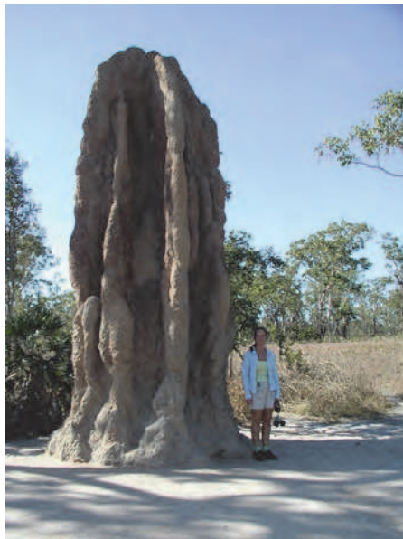
Fig. 3. Amitermes meridionalis (grass feeding) cathedral mound in Northern territory, Australia

Termites, together with their microbial symbionts, have a highly significant impact on biodegradation and biorecycling as well as shaping soil functions and properties in the tropics and subtropics (Bignell, 2006). The precise role of actinobacteria and other microbes in the life-cycle of a termite colony is still an area of research that is wide open for study (Kurtboke & French 2007).