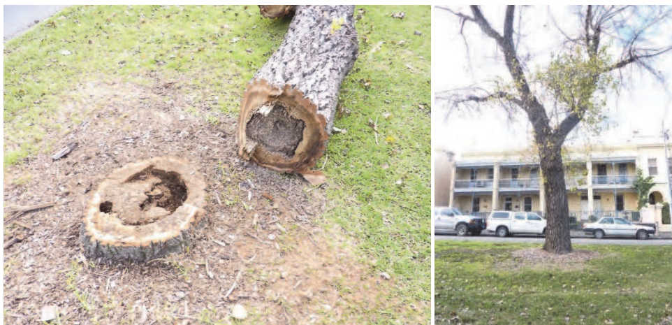
Fig. 4. Subterranean termite feeding is not random and balances the feeding territory within a living tree structure only attacking the dead cells (xylem cells) while keeping the sapwood living cells intact. Termites follow the Compartmentalization of Decay in Trees (CODIT) model perfectly. Of course, given time, the termites, just as the decay-causing microorganisms will breakdown all matter. But, in the early stages, the termites, just as the decay fungi in products, follow the CODIT model. And again, the termites will follow wound-altered wood that was preset in the living tree (see Shigo, 1979).

We recommend the further use of school children in garnishing scientific data on future termite surveys and hazard evaluations assisted by enthusiastic professional scientists. But again, this requires a total partnership approach, with industry, government and people engaging in an integrated pest management (IPM) approach to termite control based on sound ecological parameters and social priorities. These include adopting a mix of alternative strategies as mentioned above, plus planning to ensure continuous funding for termite Research & Development (R & D) and training and education programs to supply 'termite expertise' in the future.