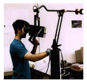
Fig. 2. A Binocular Omni-Orientation Monitor (BOOM)

The BOOM is mounted on a jointed mechanical arm with tracking sensors located at the joints. A counterbalance is used to stabilize the monitor, so that when the user releases the monitor, it remains in place. To view the virtual environment, the user must take hold of the monitor and put her face up to it. The computer will generate an appropriate scene based on the position and orientation of the joints on the mechanical arm (Aukstakalnis & Blatner,