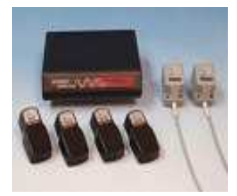
Fig. 3. Patriot wireless electromagnetic tracker

This system tracks the position and orientation of a user in the virtual environment. This system is divided into: mechanical, electromagnetic, ultrasonic and infrared trackers.