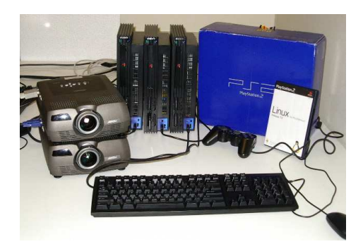
Fig. 7. PlayStation2 VR system

Low-cost VR, also called personal computer (PC)-based VR, uses inexpensive devices such as PC workstations and VR glasses, combined with VR-enabled software applications or playstations and projectors, to partially immerse viewers in a virtual scene (Fang et al., n.d.). Fig 5 is a low-cost VR system developed with three playstations, a network switch and two projectors.