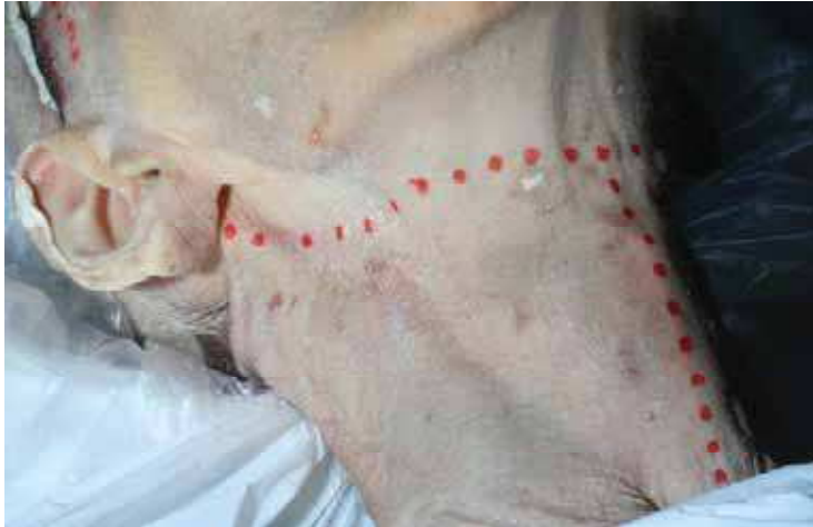
Fig. 11. Mandibular dissection, first step: cutaneous incisions.

The mandible was thus completely released (Fig. 16), without any destruction, allowing an easy repositioning in order to obtain a complete correct facial reconstruction (Beauthier et al., 2009).