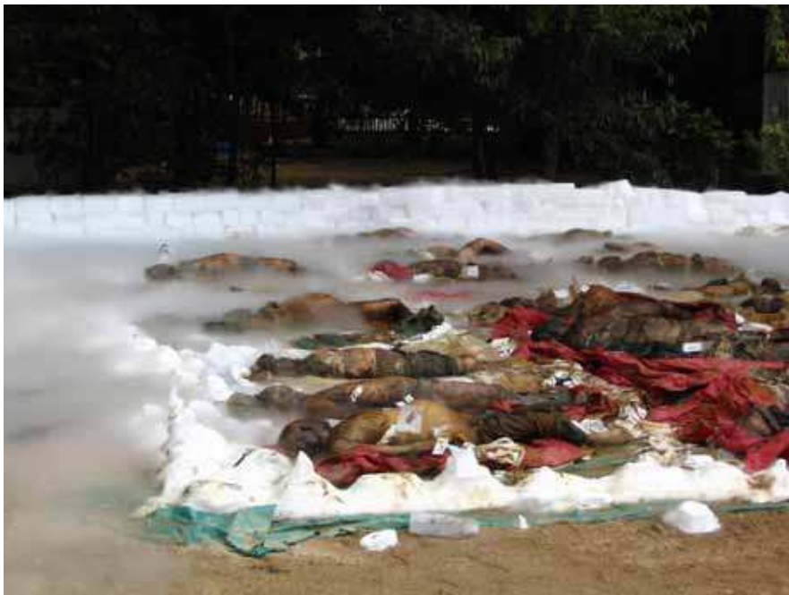
Fig. 4. Wat Yan Yao Site 1a – Khao Lak: innumerable bodies protected by dry ice (before autopsy).

The recovery of the bodies was carried out by the local Thai population prior to the time of the international teams' arrival in Thailand (Fig. 4).