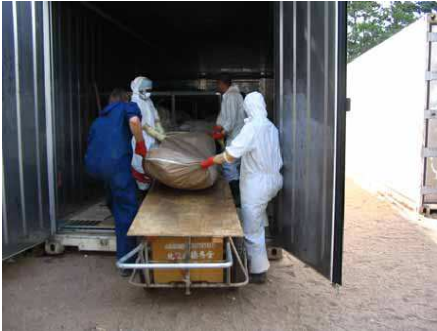
Fig. 22. Bodies' conservation (with repertory) in containers – after all PM techniques.

numbered samples with the given body number ; (iii) assuring quality control of the dental X-rays (Goodman & Edelson, 2002; Kieser et al., 2006) and (iv) quality control of all documents.