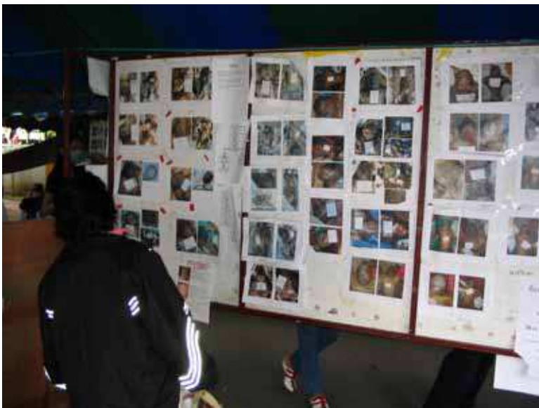
Fig. 3. The pictures: exposition of the decedents.

For a proper post mortem (PM) examination and from a logistic point of view, it is recommended that a DVI team be multidisciplinary so that, immediately after deployment and regardless of local conditions and facilities, it can operate autonomously. This requires not only the presence of specialized forensic experts on the team but also a strong added