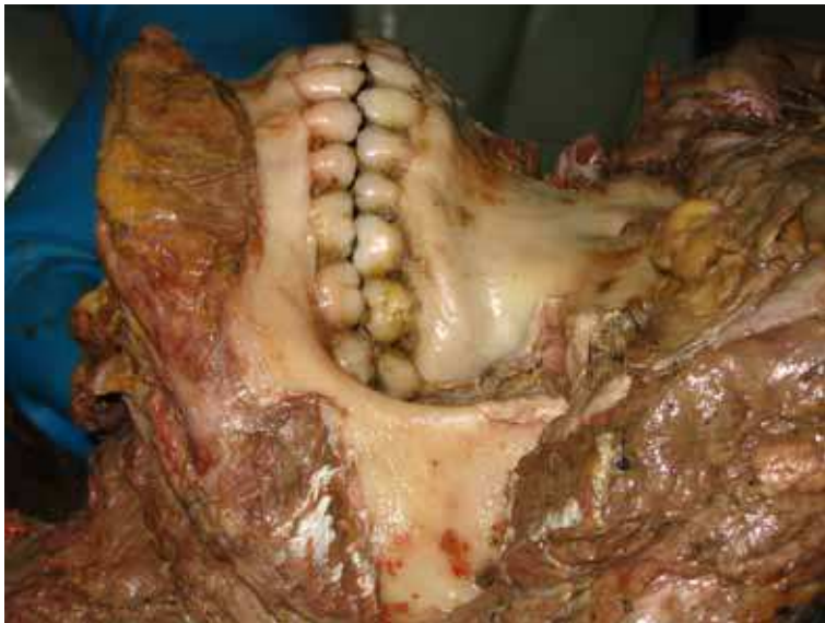
Fig. 14. Mandibular dissection, fourth step: complete cranial evidence of the mandibula .