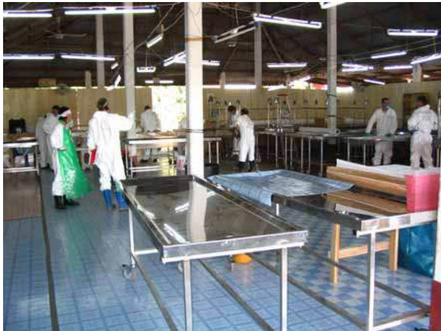
Fig. 9. Second autopsy room.