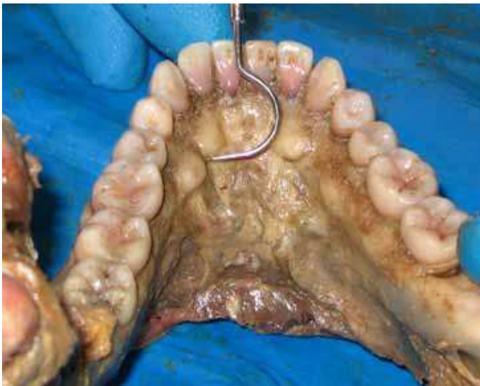
Fig. 19. Particularities – torus mandibularis .