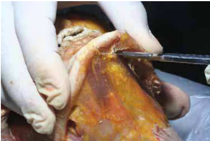
Fig. 12. Mandibular dissection, second step: buccal floor section along the inner border of mandibula .