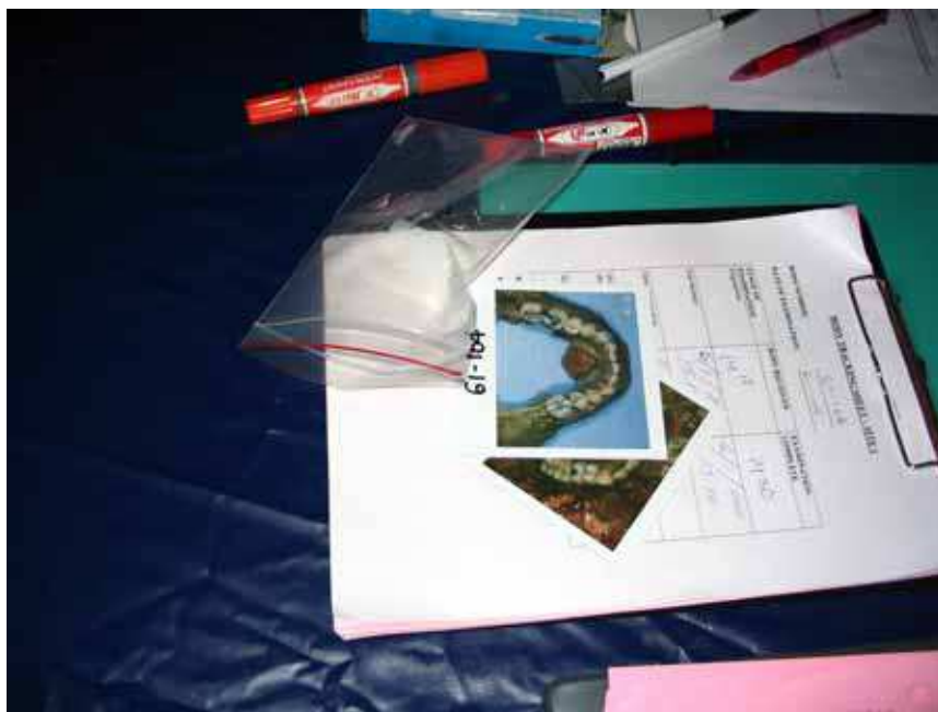
Fig. 21. Final desk.

An important place in the PM information gathering was located at the final desk (Fig. 21) by (i) checking if all examinations were carried out; (ii) checking concordance of all