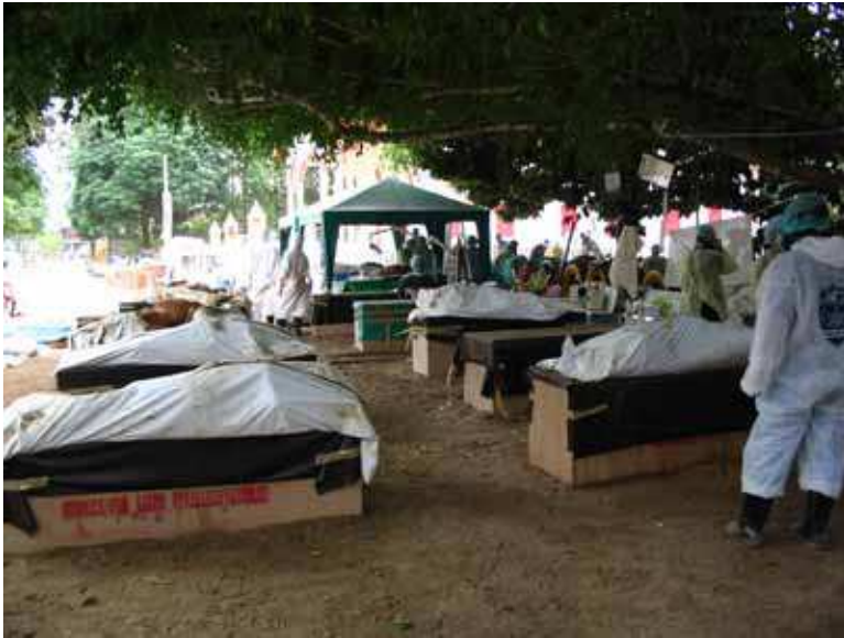
Fig. 5. Wat Yan Yao Site 1a – Khao Lak: first examinations' activities.