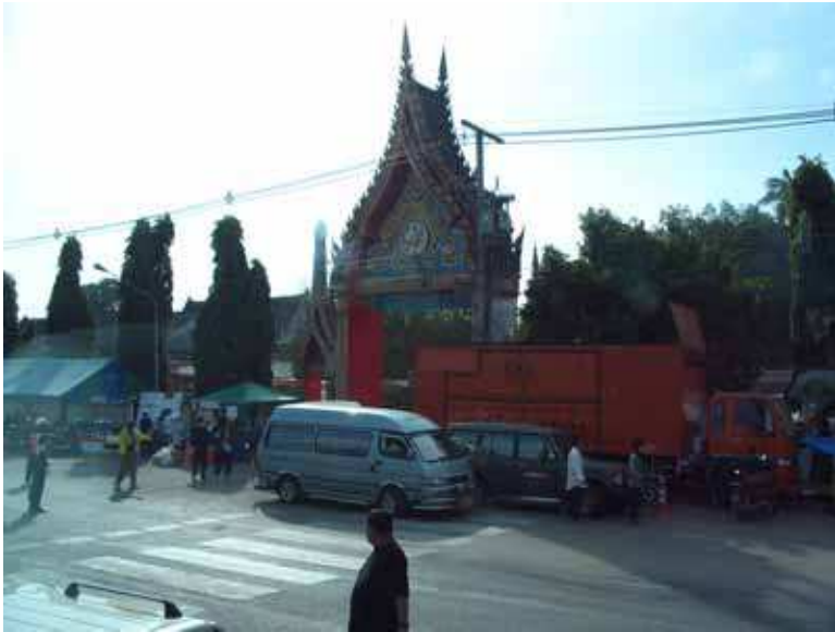
Fig. 2. Wat Yan Yao Site 1a – Khao Lak: the entry to buddish temple.