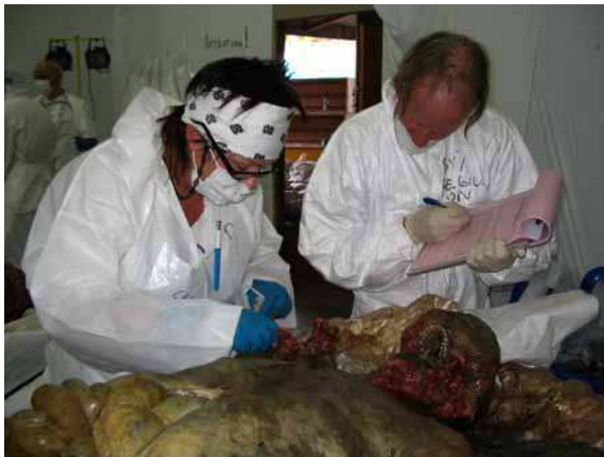
Fig. 17. Dental first examination.

This anatomical technique facilitated the forensic odontologist's PM work, with an easy access to both the maxillary and mandibular dentition (Fig. 17). Separate pictures were taken of the upper and lower jaws and teeth in occlusal position, as well as with articulating jaws (Fig. 18). The complete dentition was described using Interpol protocols, nomenclature and forms (Bajaj, 2005; Sweet, 2006) (sound teeth, pathological teeth, restored teeth, absent AM or PM teeth, attrition and oral anatomical abnormalities) (Fig. 19).