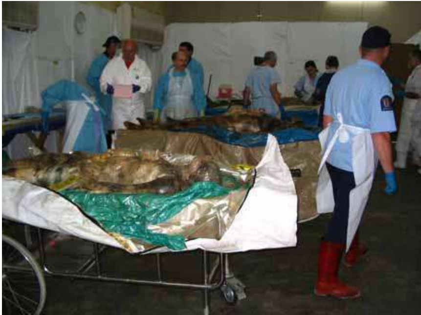
Fig. 8. First autopsy room.