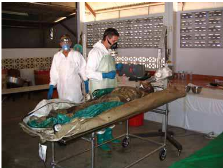
Fig. 20. Dental X-ray examination.