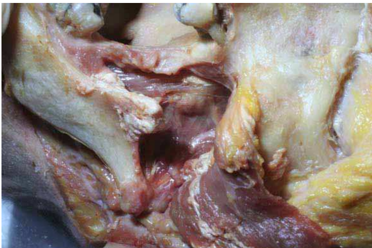
Fig. 16. Mandibular dissection, sixth step: complete disarticulation of the temporomandibular joint and muscles sections along the medial border of mandibula (left and right dissections) which can be deposited.