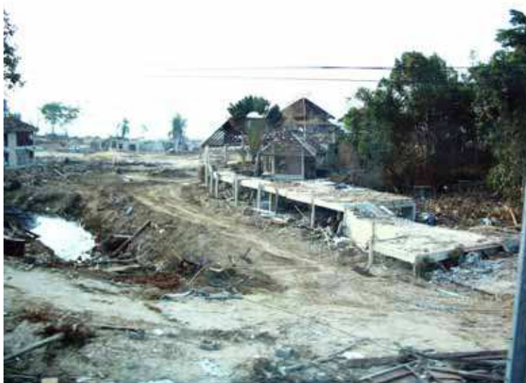
Fig. 1. General view of the disaster (Phang-Nga province).

To illustrate the different activities of the reconstructive identification process of the Tsunami victims, we refer to the activities of the Belgian Disaster Victim Identification (DVI) Team, working at “Wat Yan Yao” (Buddhist temple in Takuapa village, near Khao Lak beach, Phang-Nga province) as part of the world wide DVI community which brought assistance to the Thai government (see Fig. 1, 2 and 3).