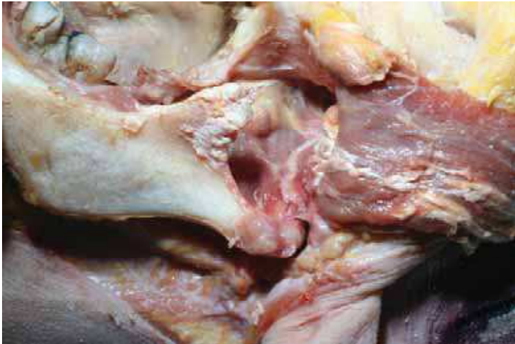
Fig. 15. Mandibular dissection, fifth step: lateral aspect of the mandibular condyle and coronoid section of the m. temporalis .