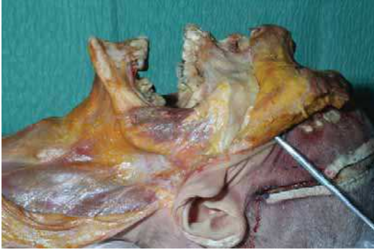
Fig. 13. Mandibular dissection, third step: facial cutaneous flap and section of masticator muscles ( m. masseter ).