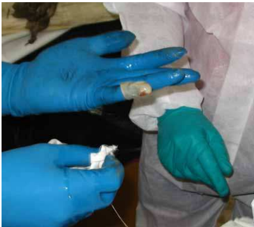
Fig. 7. Fingerprinting technique: “degloving” and “glove-on” method.

Fingerprinting was very difficult due to the condition of the bodies but was successfully realized by specialists of the technical and scientific laboratories of the different national law enforcement agencies. Finger skin was removed by “degloving” and placed on the fingertip of one of the two operators. After powdering, the fingerprints were then transposed onto paper (Fig. 7). The use of separated fingerprinting rooms proved to be very practical and useful.