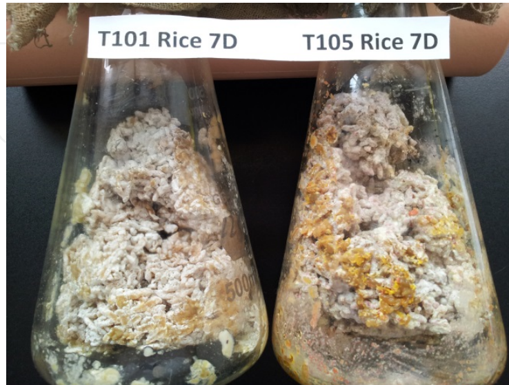
Figure 3. Solid fermentation of two streptomycete strains in rice+YIM 61 broth for 7 days at 28°C.

fermentation. The optimum component of solid medium for different actinomycetes is different from each other. It is has to emphasize that no all of actinomycetes can grow in solid fermentation.