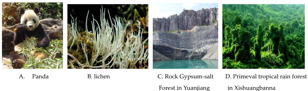
Figure 1. Sources of a part of test samples.