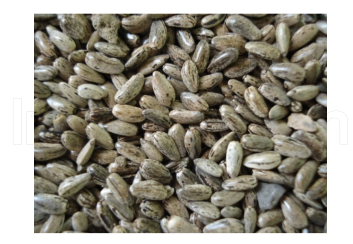
Figure 9. Milk Thistel Seeds