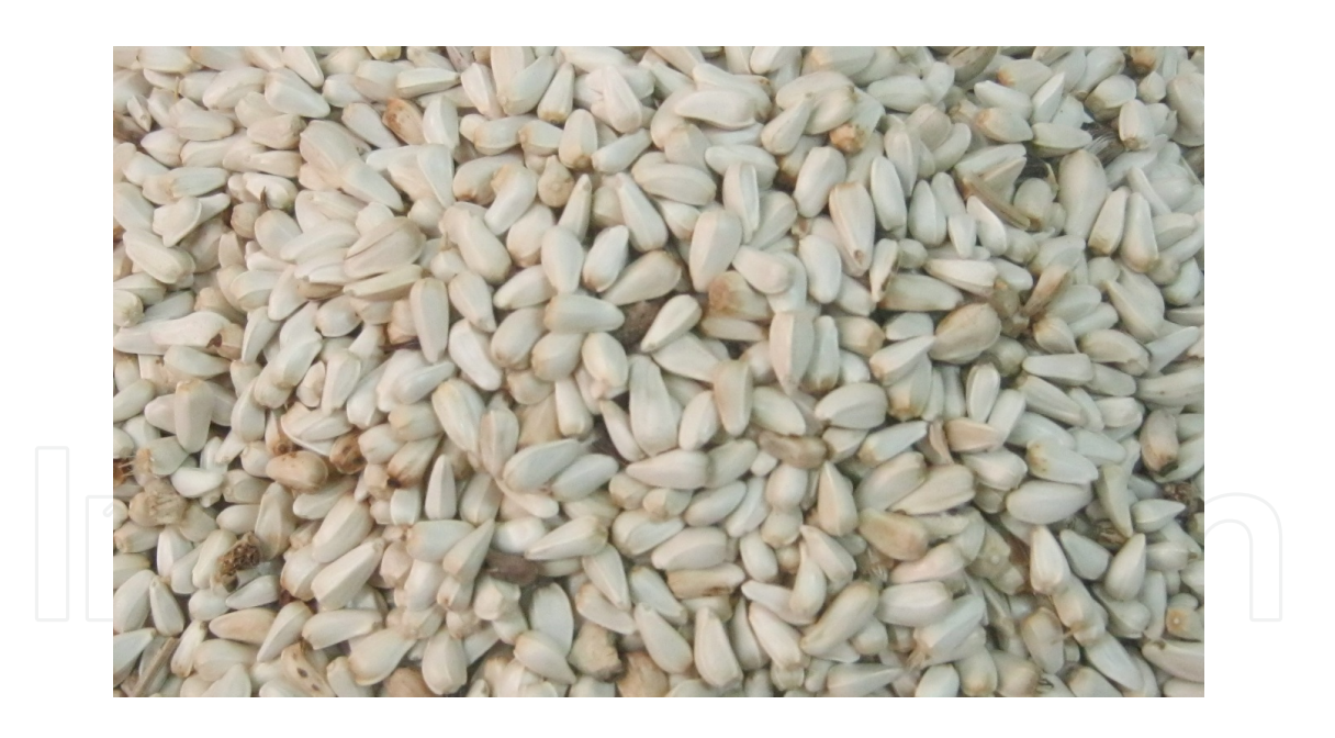
Figure 13. Safflower seeds

with white marbling on the shiny green leaves. An annual or biennial, found in rough pasture, on grassy banks, in hedgerows and on waste ground. It is locally well-established and persistent, especially in coastal habitats in S. England, but is also a widespread casual. Lowland. Native of the Mediterranean region; naturalised or casual throughout much of