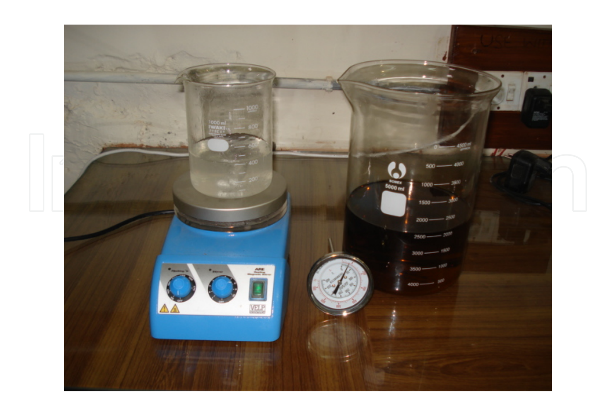
Figure 4. Preparation of Methoxide catalyst