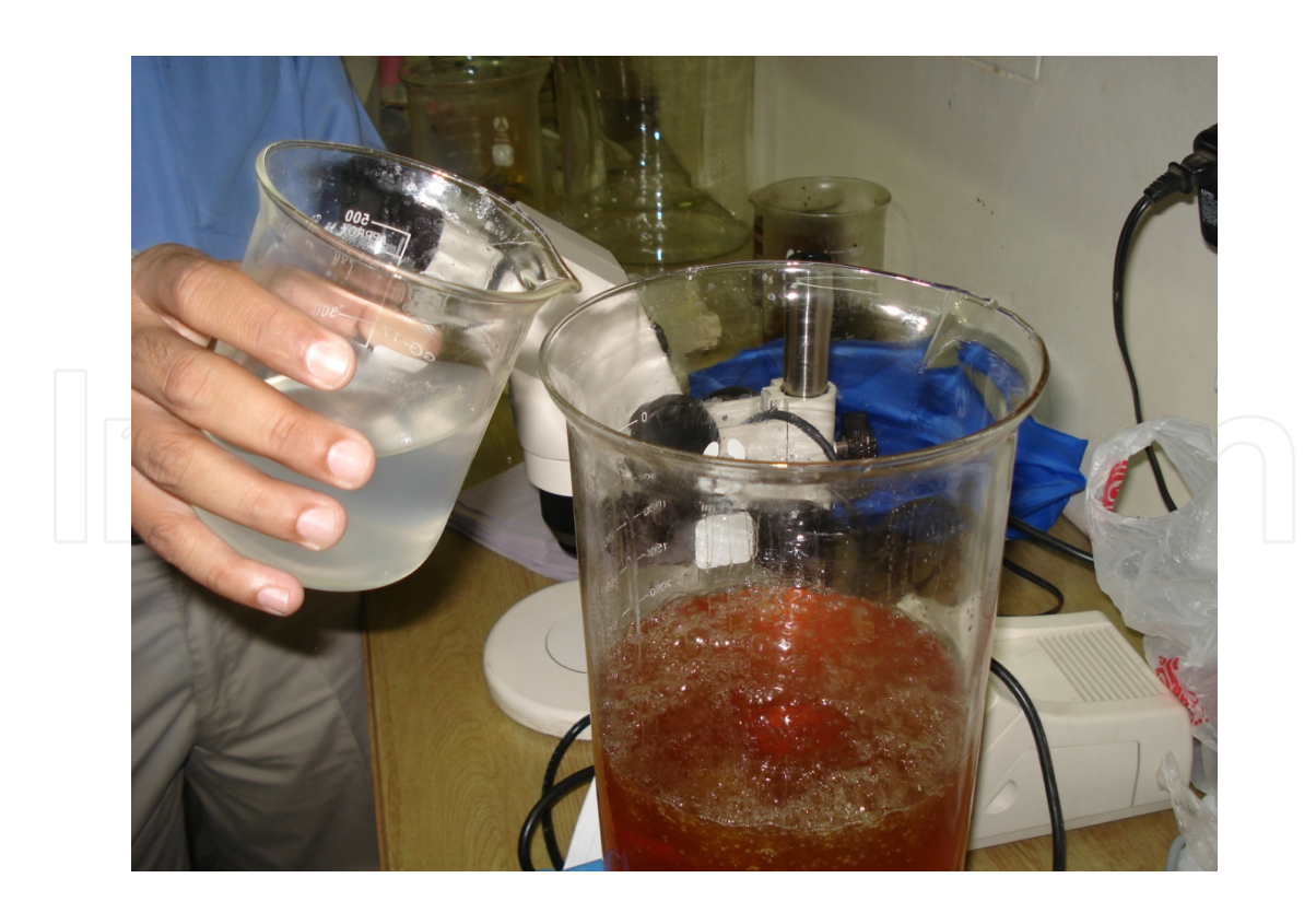
Figure 5. Mixing of catalyst