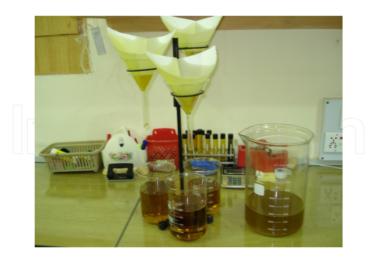
Figure 7. Biodiesel Filtration