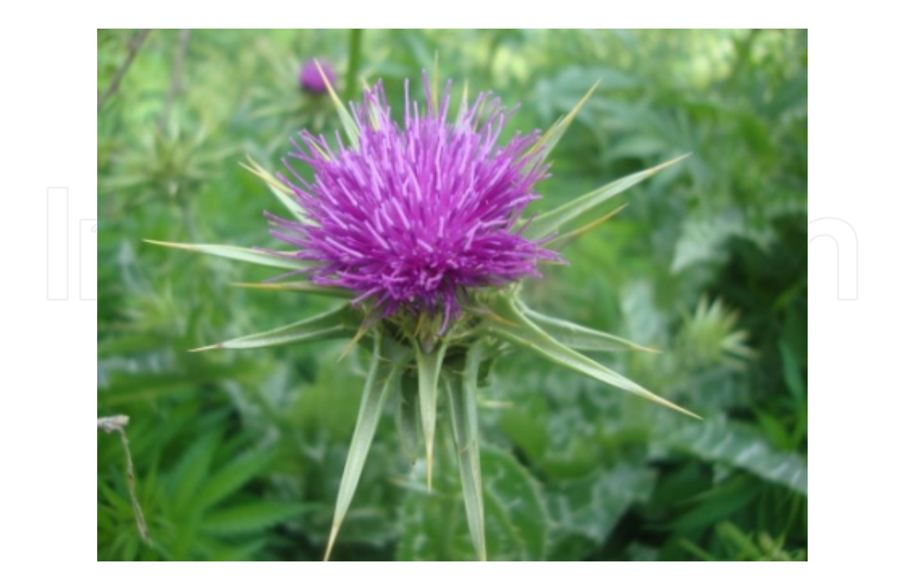
Figure 8. Milk Thistle Flower