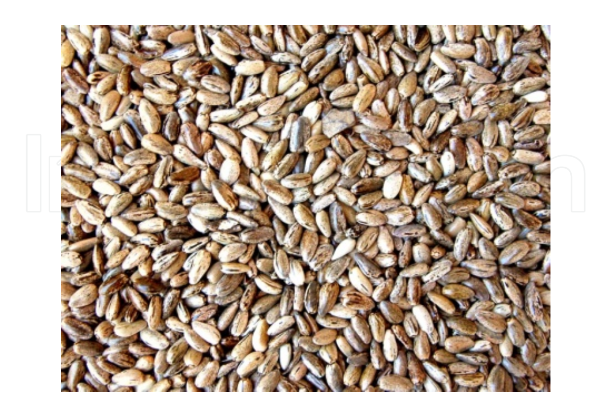
Figure 11. Wild Safflower seeds