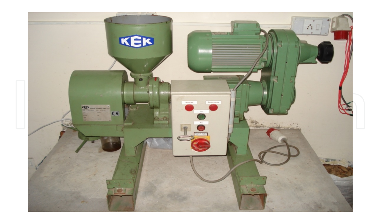
Figure 2. Electric Oil Expeller

Prospects and Potential of Green Fuel from some Non Traditional Seed Oils Used as Biodiesel 107 http://dx.doi.org/10.5772/52031