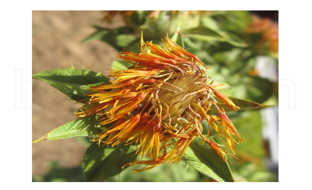
Figure 12. Safflower

Prospects and Potential of Green Fuel from some Non Traditional Seed Oils Used as Biodiesel 115 http://dx.doi.org/10.5772/52031