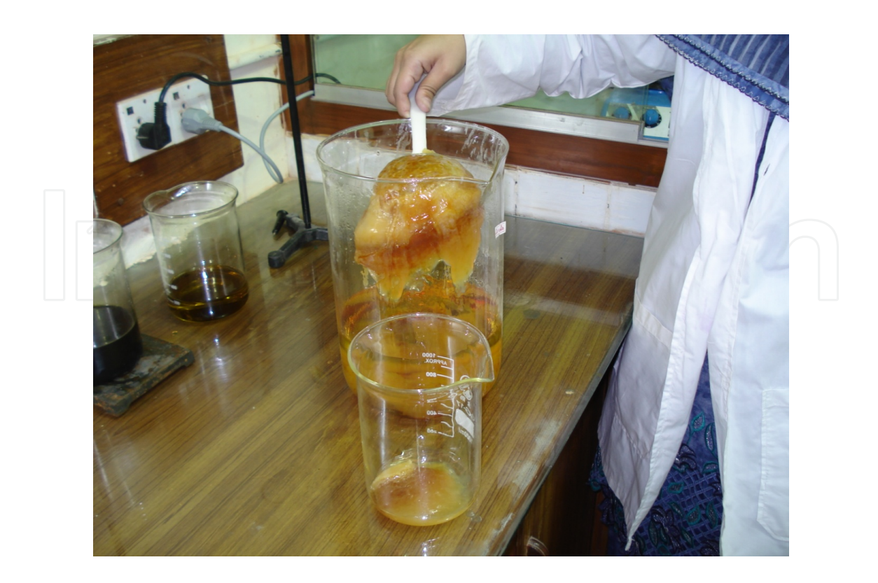
Figure 6. Separation of glycerin from Biodiesel

Prospects and Potential of Green Fuel from some Non Traditional Seed Oils Used as Biodiesel 109 http://dx.doi.org/10.5772/52031