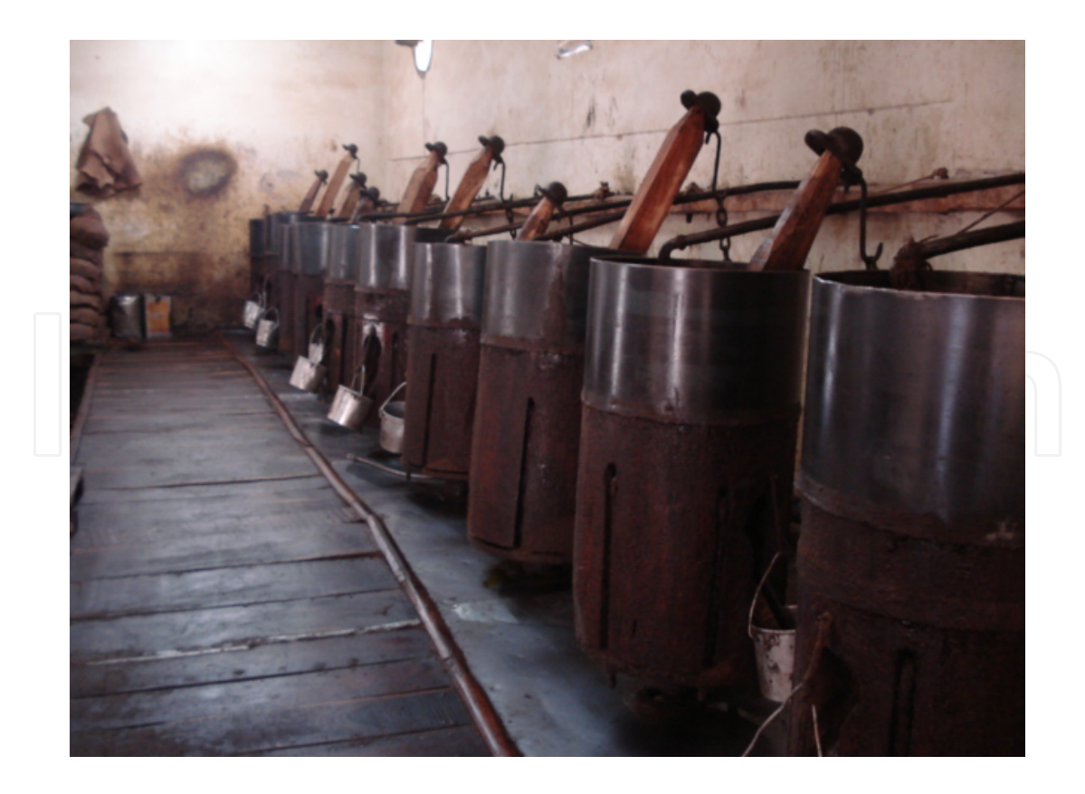
Figure 3. Mechanical Oil Expeller