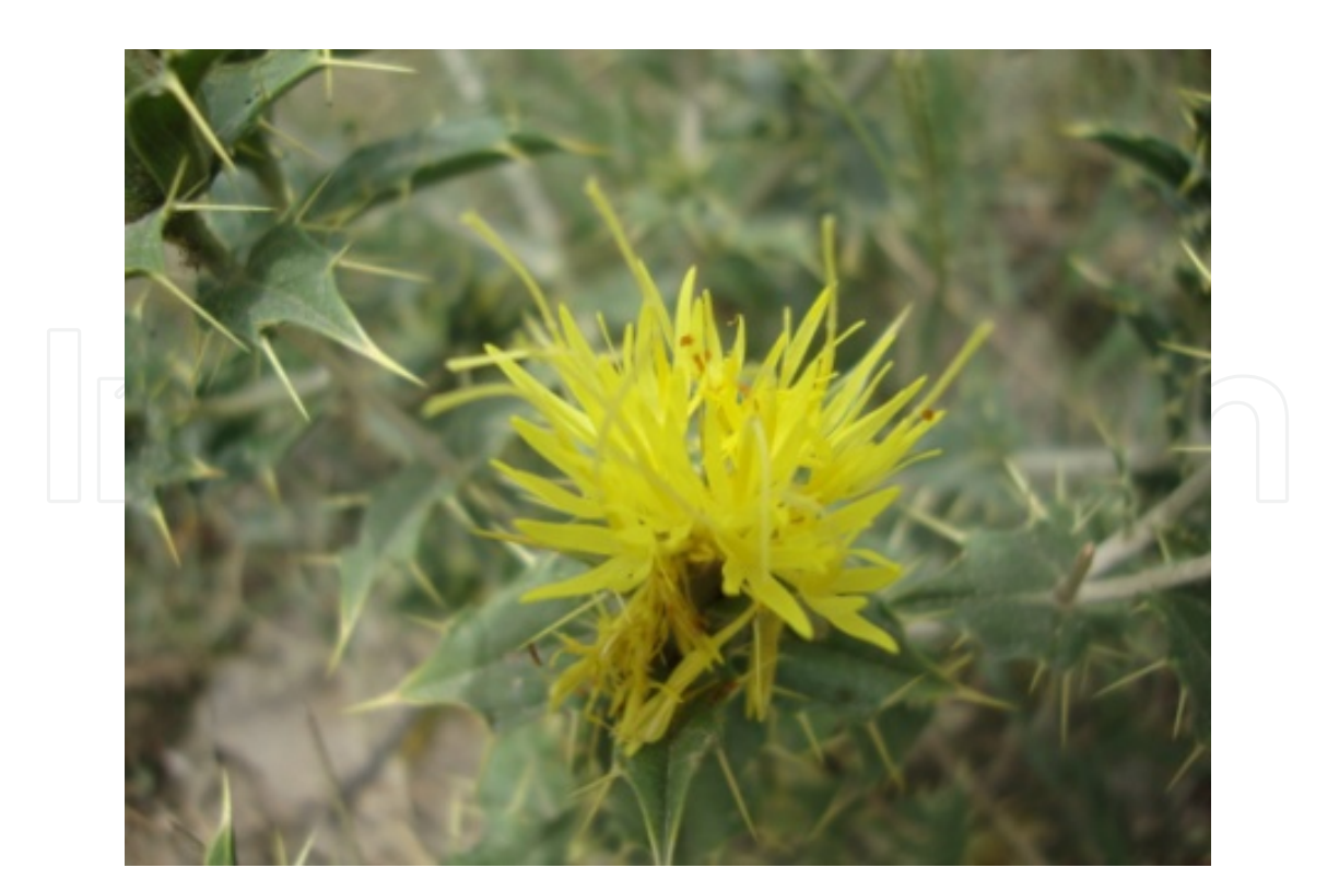
Figure 10. Wild Safflower