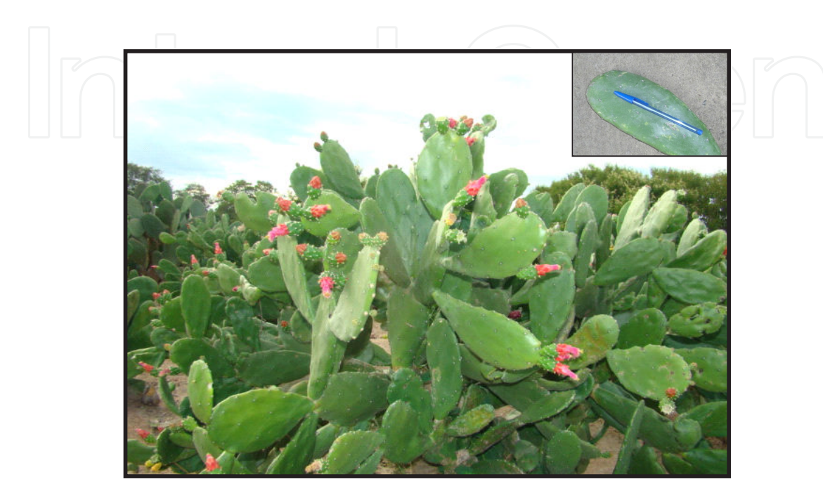
Figure 1. Palma Miúda – Nopalea cochenillifera Salm Dyck

the spineless cactus. Due to this low protein content and the high content of non-fibrous carbohydrates, the spineless cactus is an excellent replacement for a portion of poor fodder. The cultivars most used are: Palma gigante (Opuntia ficus-índica – Mill), Palma miúda (Nopalea cochenillifera Salm-Dyck) and Palma redonda (Opuntia ficus-índica – Mill), where are illustrated in Figures 1, 2 and 3 respectively.