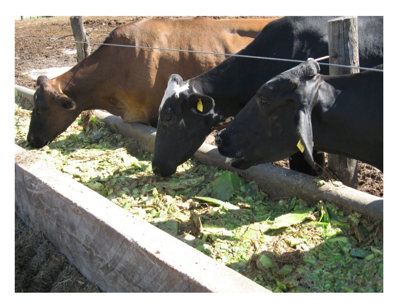
Figure 5. Dairy cows eating total mixed ration.

Changes in the amount of milk fat indicated that the production of saliva was probably also decreased, which would have subsequent effects on rumen conditions [51]. The NDF and NFC contents in the diet were 30.3% and 39.22%, respectively. These values are notably close to the limits recommended by the [25] for maintaining rumen health and milk fat. Thus, any changes in the proportion of feed components could significantly alter these values and the nutritional balance of the feed supplied to the animals. According to [52], the balance of structural and non-structural carbohydrates is important for animal health and function along with nutrient utilization, which is one of the intended goals of providing the diet as a complete mixture. A better utilization of energy for milk production was also observed when using a complete mixture feeding strategy, rather than supplying the ingredients separately [53]. A better utilization of energy for milk production was also observed when using a complete mixture feeding strategy, rather than supplying the ingredients separately (Figure 5)