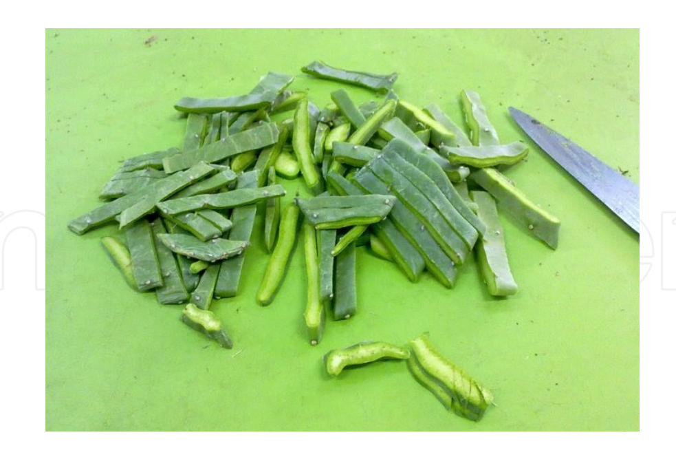
Figure 9. Spineless cactus minced with a knife