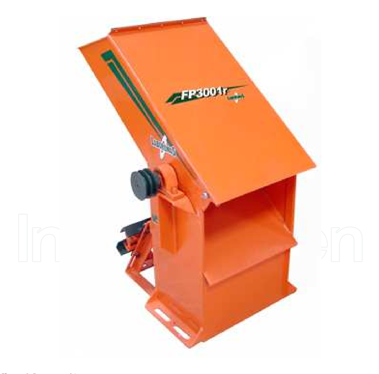
Figure 6. Forage machine

is that mincing with a knife does not lead to mucilage exposure, while the use of forage equipment does. When cactus was combined with sugarcane bagasse and soybean meal and fed to lactating cows, higher consumption rates were observed when the cactus was passed through a forage machine compared to processing with a knife (16.3 versus 15.2 kg/day, respectively) [54]. This result probably reflects the exposure of the mucilage, which adheres to the other feed components. As a result, feed selectivity is reduced, and consumption of the complete feed, including unpalatable components such as sugarcane bagasse, is facilitated. Animals that received cactus minced with a knife had a greater opportunity to select particular feed components, which resulted in an imbalance of structural and non-structural carbohydrates in the diet. In turn, this imbalance led to a reduction in milk fat compared to animals fed cactus processed using a forage machine (36 versus 39 g/kg, respectively).