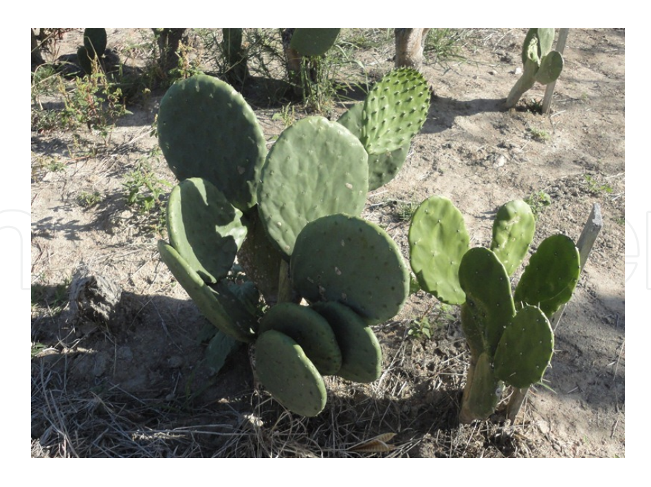
Figure 3. Palma Redonda – Opuntia ficus-índica - Mill

The high levels of calcium, potassium, and magnesium in cactus (Table 2) may reduce the absorption of these minerals, as well as limit microbial growth and the digestibility of different nutrients [19]. As with the majority of tropical forages, the amounts of phosphorous in cactus are considered low and insufficient for the needs of animals [20].