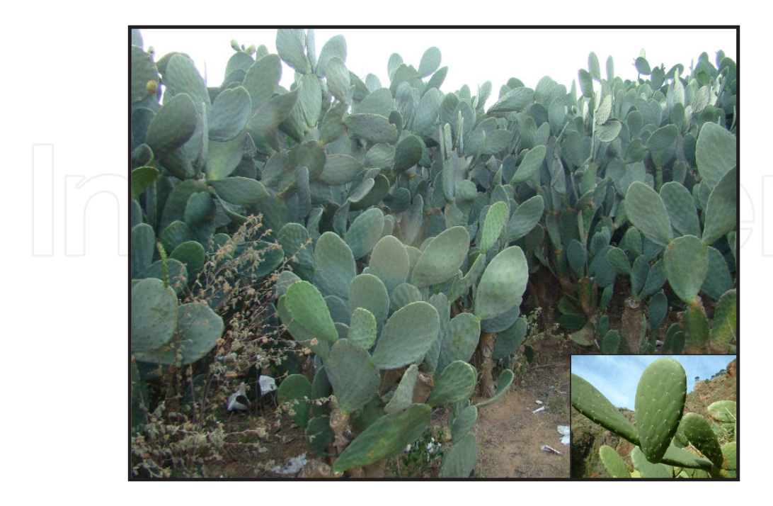
Figure 2. Palma Gigante – Opuntia ficus-índica Mill