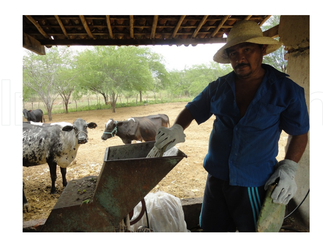
Figure 7. The laborer doing the process