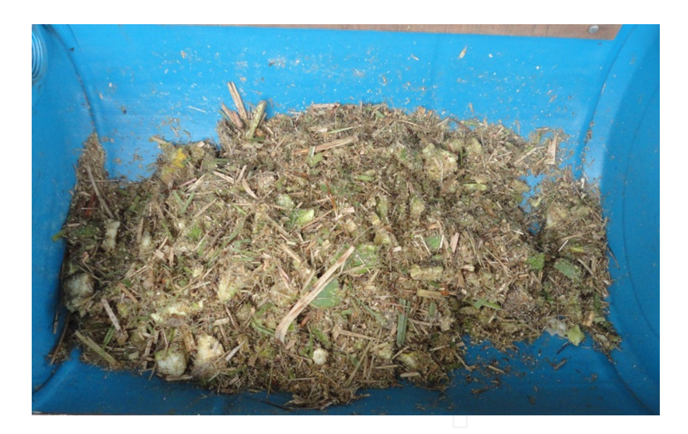
Figure 4. Total mixed ration containing spineless cactus

The most common approach to administering cactus to dairy cattle is mincing it in the trough without mixing it with any other roughage. The concentrate, when used, should be offered at the time of milking. When the feeds are supplied separately in this manner, it is not always possible to obtain an accurate estimate of the real intake of these feeds, especially when more than one type of roughage is consumed. This difficulty in measuring is due to a preference for certain feeds, making it difficult to calculate the average individual consumption and to characterize the diet ingested by the animal. It is important to stress that roughage rich in NFC, such as cactus, may cause a number of rumen disorders when provided separately and in large amounts. As a result, the use of the complete ration or TMR (total mixed ration) has become a common practice for regulating the composition of the diet [29]. These approaches also contribute to the supply of the diet, which should provide an adequate balance of nutrients. As a result, the use of the complete ration or TMR (Figure 4) has become a common practice for regulating the composition of the diet.