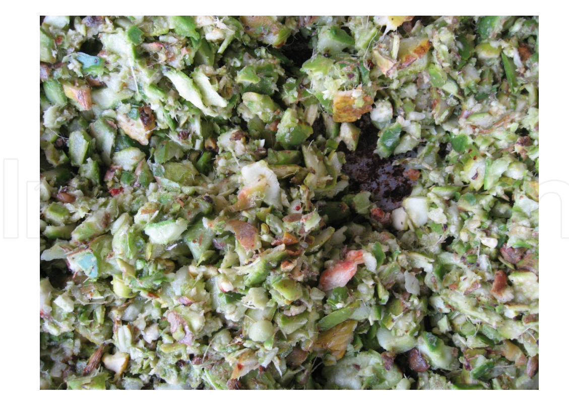
Figure 8. Spineless cactus processed in machine