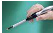
Fig. 5. Harmonic/ultrasonic scalpel.