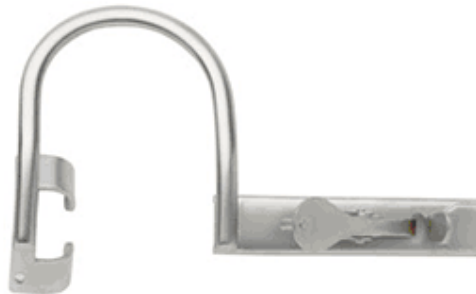
Fig. 2. Open-sided mouth gag (Davis Mouth Gag).

For a successful surgery, adequate exposure, of the oro-pharynx must be achieved. Also knowledge of the relevant anatomy and tissue tension is important. With the aid of a mouth gag, e.g. Boyle -Davis (Figure 2), the oropharynx is exposed. Dentition may be protected by a plastic or rubber athletic mouth guard and careful mouth gag placement. Care is taken not to allow the lateral flanges of the tongue blade of the gag to scratch dental enamel. Protection of the mucosa from electrical and thermal conductivity is achieved by interposing a gloved finger between the instrument metal and the patient. 13