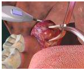
Fig. 3. Medial Traction on the Tonsil.

The tonsils are then removed using 1 of the techniques described later.