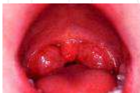
Fig. 1. Orophaynx with Palatine Tonsils.

The tonsils are well vascularized with the majority of the blood supply arising from the tonsillar branch of the facial artery. 1 The nerve supply of the tonsils arise from the ninth cranial nerve and descending branches from the lesser palatine nerves and the tympanic branch of CN IX is thought to account for the referred ear pain found in some cases of tonsillitis. The tonsils have no afferent lymphatic vessels. Their efferent lymph drainage is through the upper cervical nodes, especially to the jugulodigastric group. Tonsils and adenoids are immunologically most active between the ages of 4 and 10 years, and tend to involutes after puberty. 2