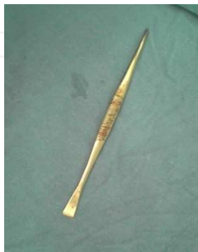
Fig. 4. Tonsil Dissector.

A frequently used method for total tonsillectomy is the “cold” or sharp dissection technique. In this technique, the tonsil and capsule are dissected from surrounding tissue using scissors, knife, or t dissector (Figure 4) and the inferior pole is amputated with a tonsil snare.