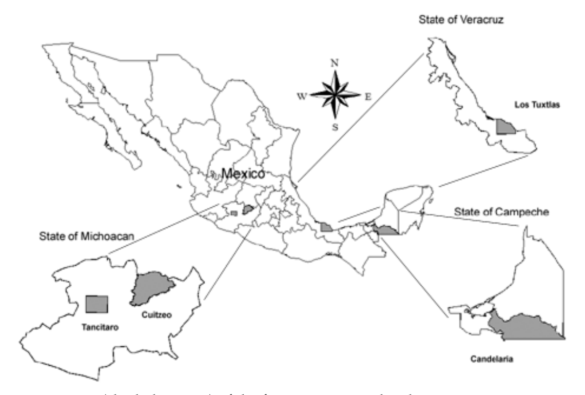
Fig. 2. Location (shaded in grey) of the four eco-geographical areas in Mexico.