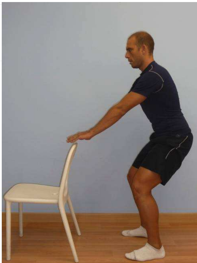
Fig. 11. Forward bending test.

Patient stands with his/her feet shoulder-width apart, facing the seat of a chair. He/she is instructed to bend forward, to touch the chair seat, and to stand back up again. Optimal control occurs when the patient unlocks his/her knees and anteriorly tilts his pelvis, flexing only slightly at the lumbar spine. Poor control will be present when he locks out and hyperextends the knees; he/she should not tilt his pelvis but instead should flex markedly at the lumbar and thoracic spine.