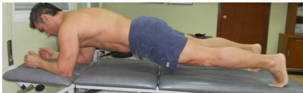
Fig. 19. Bridge in prone position