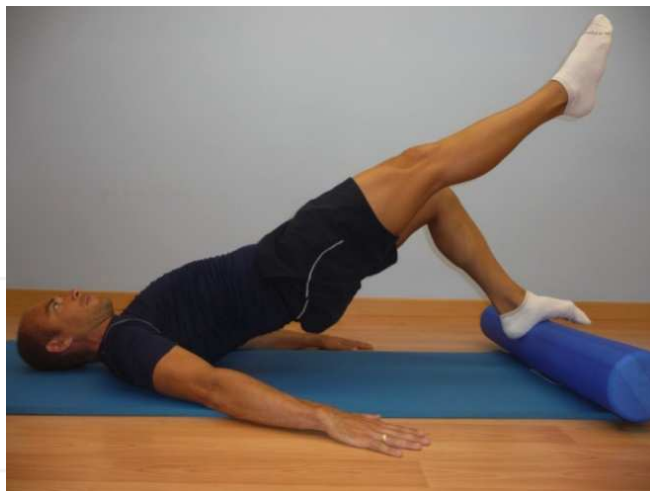
Fig. 31. Bridge with heel raise on roller.