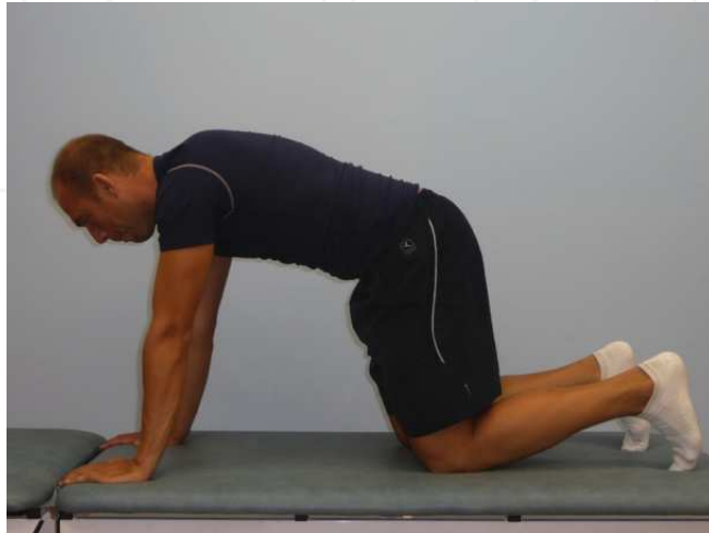
Fig. 9(a). Kneeling rock-back; starting position.

Patient is kneeling on a mat on all fours, with his/her hand directly beneath his shoulder and his knee beneath his hip. The test begins with the lumbar spine in a neutral position and then is rocked backward, pulling the hip behind the knees. Examiner should monitor the pelvic tilt angle and lumbar lordosis. Motion should begin at the hip for an optimal segmental control. Once hip flexion passes about 120^\circ (depending on patient's body proportions), his pelvis should posteriorly tilt and his lumbar spine flatten. Examiner should ensure that he moves slowly, and determine whether the sequence is motion at the hip-pelvis-lumbar spine. Poor segmental control will be present if the pelvic tilts and the lumbar spine flattens at the beginning of the rock-back.