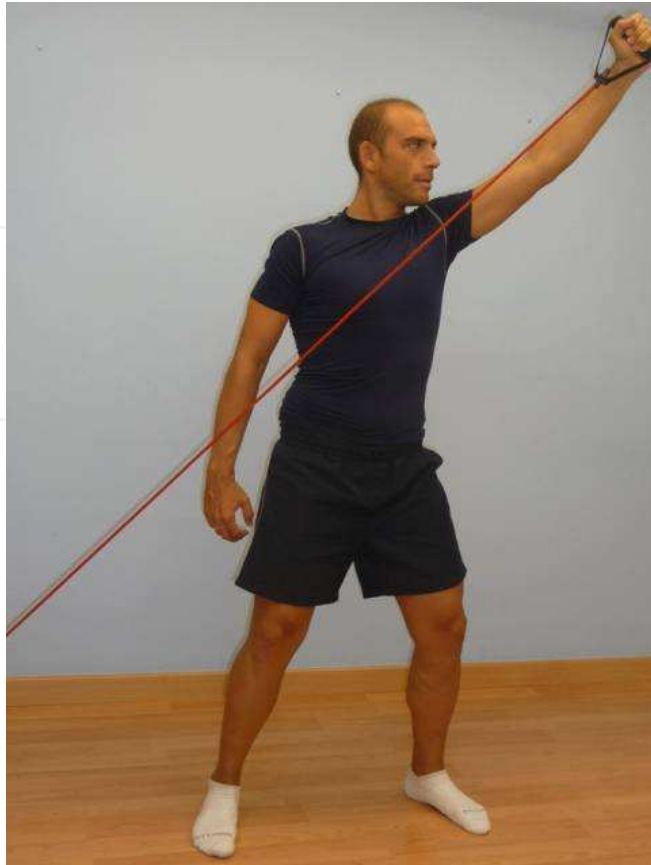
Fig. 24. Open chain exercise of upper limb after co-contraction of transversus abdominis and multifidus.