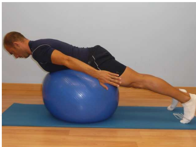
Fig. 28. Basic superman.