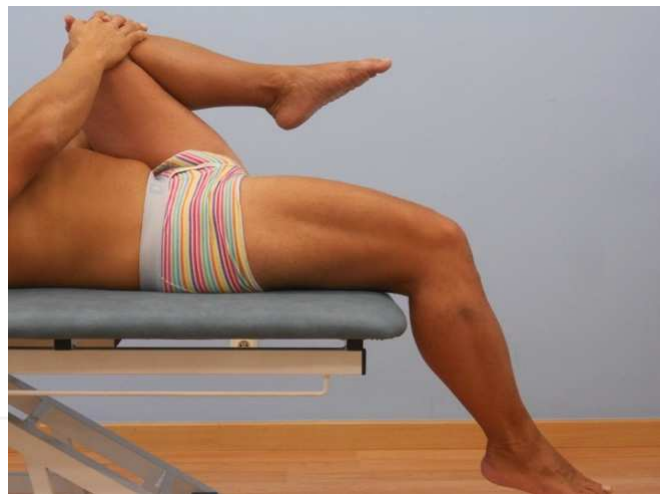
Fig. 3(c). Modified Thomas test (rectus femoris shortened).