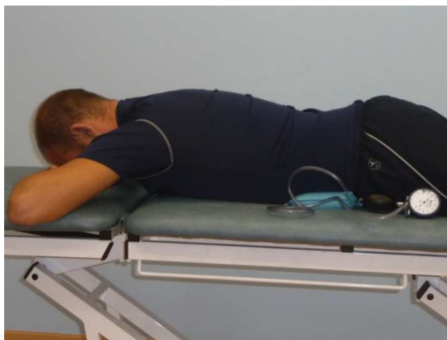
Fig. 8. Prone abdominal hollowing test using pressure biofeedback.

With the patient lying prone, a pressure biofeedback unit is placed under his/her abdomen with the upper edge of the device's bladder below his navel. The unit is then inflated to 70 mmHg and patient is instructed to perform the abdominal hollowing maneuver. The aim is to reduce the pressure reading on the biofeedback unit by 6 to 10 mmHg and to maintain this contraction for 10 repetitions of 10 sec. each while breathing normally.