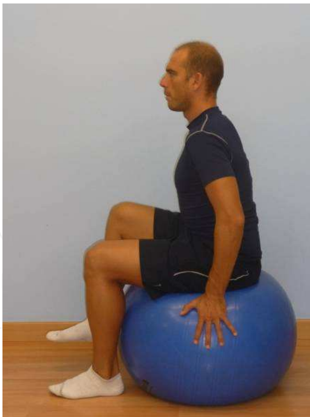
Fig. 25. Sitting knee raise on gym ball.