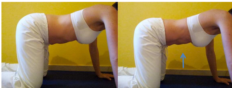
Fig. 15. Abdominal hollowing: activation of transversus abdominis in four point kneeling.