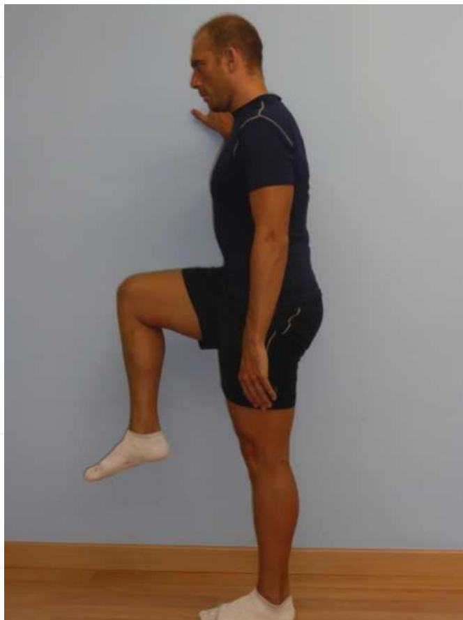
Fig. 10. One-leg lift.

Patient stands side-on to a wall with one hand on the wall for balance if needed. He/she is instructed to slowly lift one leg, with the knee bent. The leg should reach a comfortable position -usually above hip height- and then lower. The examiner monitors the lumbar-pelvic region from the front and the side. In optimal alignment, the pelvis should remain level horizontally as the patient lifts his leg, and the sequence should be hip motion (flexion) followed by pelvic motion (posterior tilt) followed by lumbar motion -lordosis flattens and then reverses-. Poor control exists when the pelvis drops as the leg is lifted, and the lumbar spine flexes during the early stages of the movement.