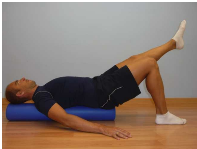
Fig. 30. Supine-lying leg lift.

Supine-lying leg lift. Goal: to develop back stability in an unstable lying position.