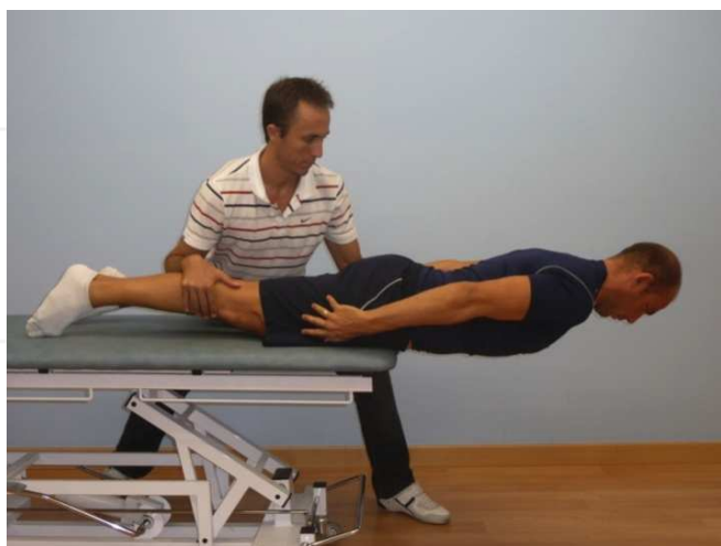
Fig. 7. Sorensen test.

Goal: to determine isometric endurance of trunk extensor muscles.