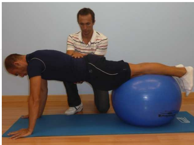
Fig. 29. Bridge with therapist pressure.