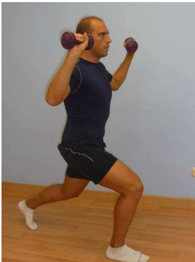
Fig. 18. Closed chain lunge exercises, with the addition of hand weights.