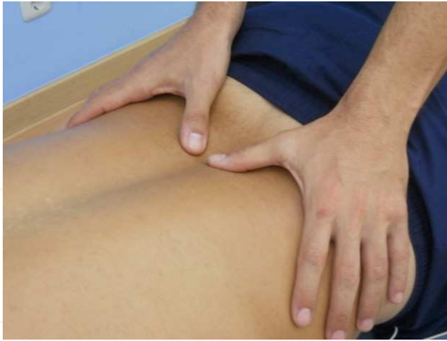
Fig. 12. Activation of multifidus in prone position.