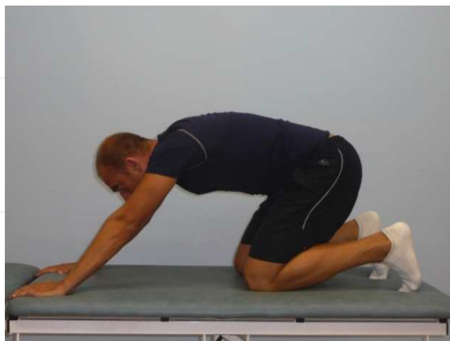
Fig. 9(b). Kneeling rock-back; ended position.