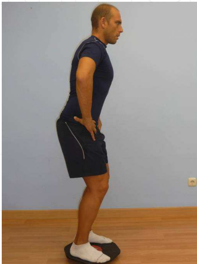
Fig. 17. Stand-up position on unstable surface.

The purpose is to maintain local muscle synergy contraction, while gradually progressing load cues through the body using weightbearing closed chain exercises. Weightbearing load is added very slowly, ensuring any weightbearing muscle at any kinetic chain segment is activated in order to give effective antigravity support and provide efficient and safe load transfer through the segments of the body. The focus is especially to ensure activation of the local and weightbearing muscles of the lumbar spine and pelvis, and the ability to maintain a static lumbopelvic posture for weightbearing. These muscles are likely to be dysfunctional in patients with low back pain. In addition, lifestyle factors of many individuals, which could have led to a dysfunction in these muscles, need to be addressed, as they may place them at risk of sustaining further low back injury.