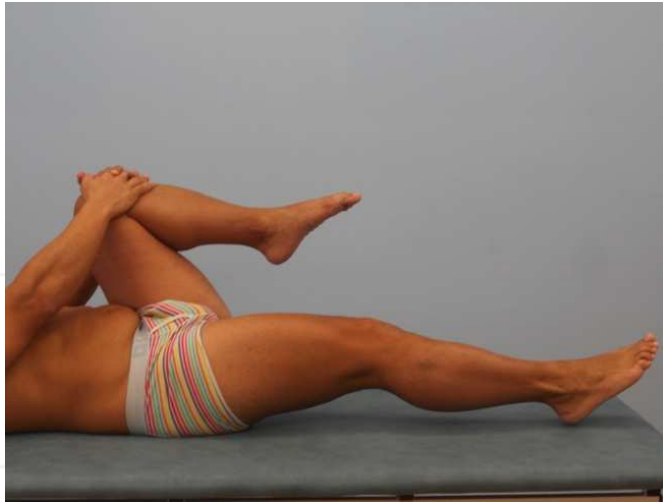
Fig. 3(b) Thomas test (iliopsoas shortened).