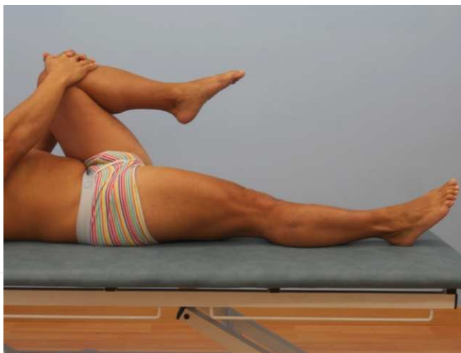
Fig. 3(a). Thomas test (no shortness).

The same procedure with the examined leg out of the table (figure 3c) elucidates a shortened rectus femoris. Optimal alignment occurs with the femur horizontal and aligned with the sagittal plane (no abduction) and with the subject's shoulder, hip, and knee more or less in line. A positive test is indicated when the tibia loses their vertical position due to knee extension. The test is negative when the tibia remains vertical.