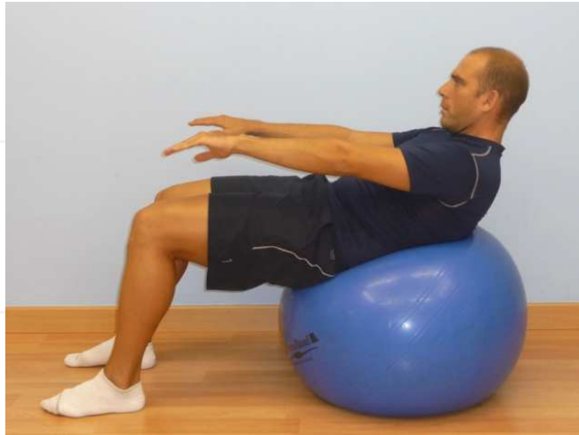
Fig. 26. Abdominal slide.