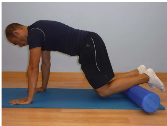
Fig. 32. Prone tuck on roller.