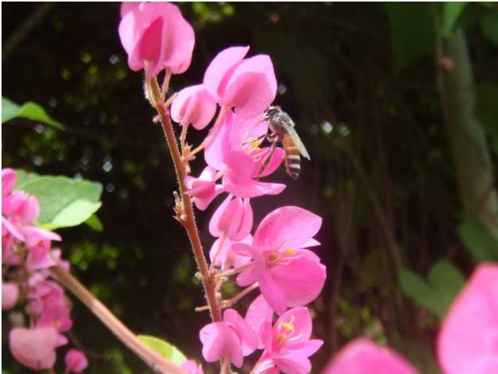
Fig. 1. Apis florea is foraging on flower.

The quality of fruits and seed of any plant species are dependent upon the intensity of pollination that involves the transfer of the male gamete, pollen, from the anther to the stigma, the receptive female structure of the flower. If the pollen is viable and compatible with the female tissue, it will produce a pollen tube that grows down into the ovary where fertilization of the ovule occurs, leading to the formation of a seed. Honeybees are a good facilitator for moving pollen from one part of a flower to another, or from one flower to another. Furthermore, insufficient pollen transfer can lead to poor fertilization of ovules, non-symmetrical fruit, and high rates of fruit drop. Many of these problems can be avoided by placing honeybee colonies in the orchard during the bloom period. The proper use and placement of honeybee colonies will help insure maximum benefits of pollination (Partap, 1992; Suwannapong et al. , 2011).