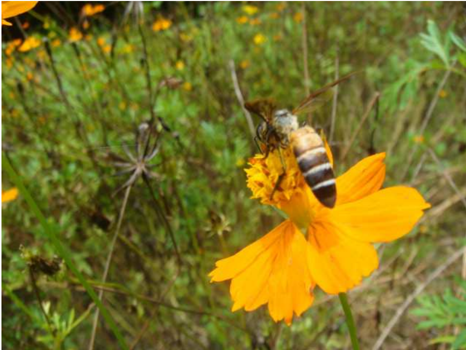
Fig. 2. Pollen source plant of Apis dorsata