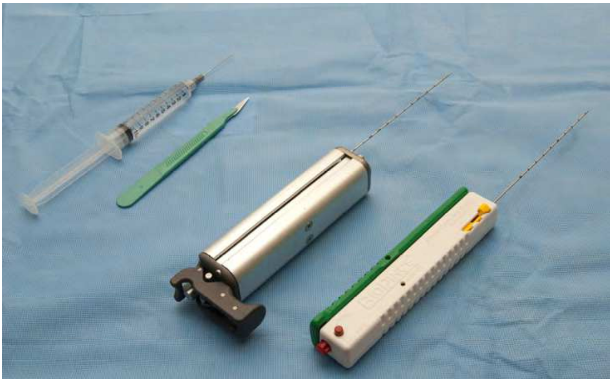
Fig. 3. Automated biopsy-gun

Several types of needles have been used during medical history to perform percutaneous renal biopsy. In 1951, Iversen and Brun (Iversen & Brun, 1951) described a percutaneous native kidney biopsy technique using an aspiration needle. Later, Kark and Muehrcke (Kark & Muehrcke, 1954) published a technique whereby cutting needles were employed, such as the Franklin-Vim-Silverman and the Tru-Cut (Baxter, Deerfield, IL) needles. The automated biopsy-gun (Figure 3) became popular in the nineties based on its potential benefits in reducing bleeding complications, for shorter actual time the needle resides in the kidney, and the fact that it requires less dexterity by the operator (Madaio, 1990). A randomized prospective trial comparing the two methods showed adequate tissue sampling, but the extent of bleeding was more severe in the free-hand biopsy group (D. Kim et al., 1998).