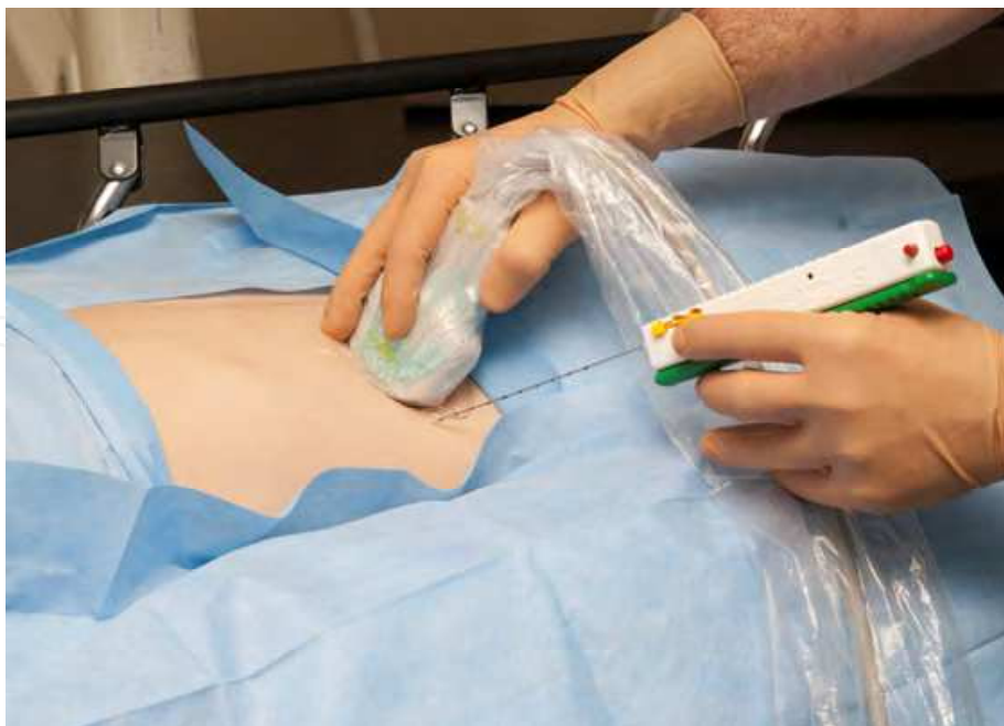
Fig. 2. Real-time ultrasound biopsy in prone position

The low occurrence rate of bleeding complications with percutaneous kidney biopsies performed under real-time ultrasound led to elective procedures in an outpatient setting using standardized protocols. Overnight hospitalization would not be therefore needed, reducing the overall cost of elective renal biopsies.