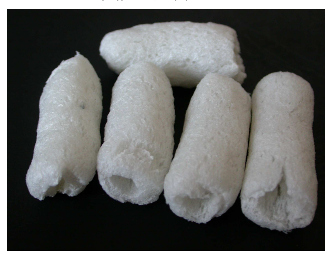
Fig. 1. Extruded starch foams.

Shredded newsprint and cardboard, popcorn, flour, starch and expanded polystyrene (EPS) are the most common materials used to protective packing products. Their function is to provide cushioning, protection, and stabilization of articles packaged for transport. EPS-based loose-fill foam products have enjoyed a steady growth in this application over the last decades, but became targeted recently in the solid waste disposal debate. Huge quantities of plastic is used for refuse and retail bags, egg cartons, packaging film, and loose fillers.