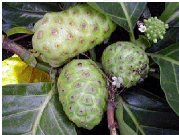
Fig. 1. Unripe fruit

The genus Morinda ( Rubiaceae ), which includes the species M. Citrifolia L., is made up of around 80 species. M. Citrifolia is a bush or small tree, 3-10 m tall, with abundant broad elliptical leaves (5-17 cm length, 10-40 cm width).