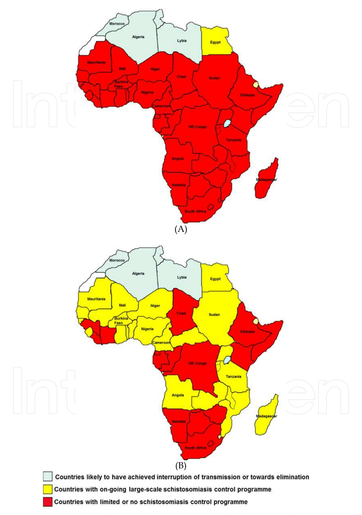
Fig. 1. Comparative status of schistosomiasis control in Africa at the end of the 20th century (A) and in 2010 (B).