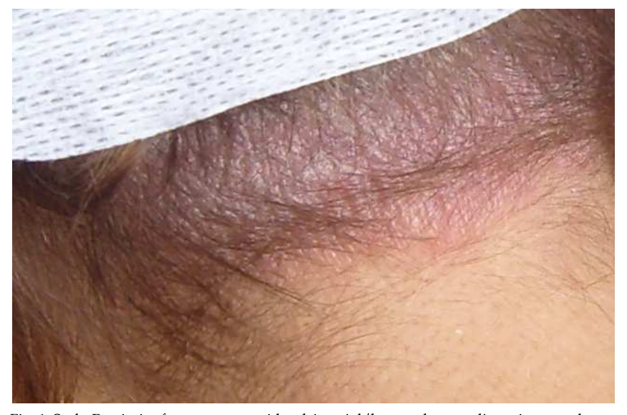
Fig. 1. Scalp Psoriasis after treatment with calcipotriol/betamethasone dipropionate gel formulation, applied once daily for 4 weeks.

Calcipotriol/betamethasone dipropionate was often associated with fewer lesional/ perilesional adverse reactions than calcipotriol or tacalcitol and did not appear to be