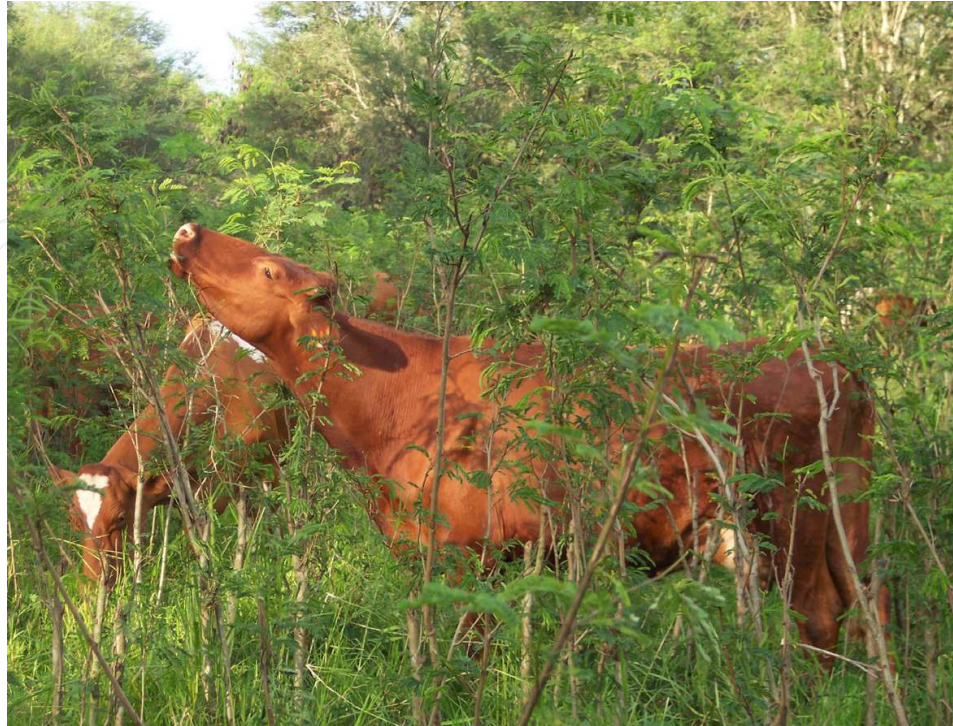
Picture 1. Lucerna cows grazing in a high density silvopastoral system. Picture: Liliana Mahecha, in Hatico Natural Reserve

Colombia exhibits low productivity and competitiveness ( Colombian Ministry of Agriculture and Rural Development, 2005 ) expressed as low number of animals per ha (average 1.2), low birth rate (less than 69%) and low weight daily gain (between 350-450 g/d) ( Mahecha et al. 2002 ). These parameters have shown only modest productivity increments during the last 10 years, with a few exceptions. It is predicted that the situation will worsen in coming years due to the global climate change. According to the IPCC (2007) , the air temperature will increase from 2.4 to 6.4° C with an average of 4.0°C increasing 0.2°C per decade, which is expected to cause a decline in animal performance ( Nardone et al., 2010 ).