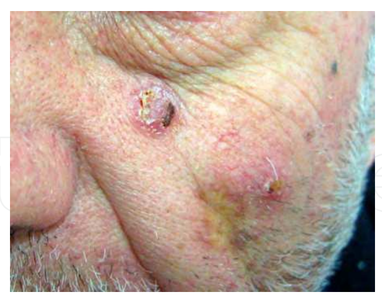
Fig. 1. Basal cell carcinoma as nonhealing sore on face.