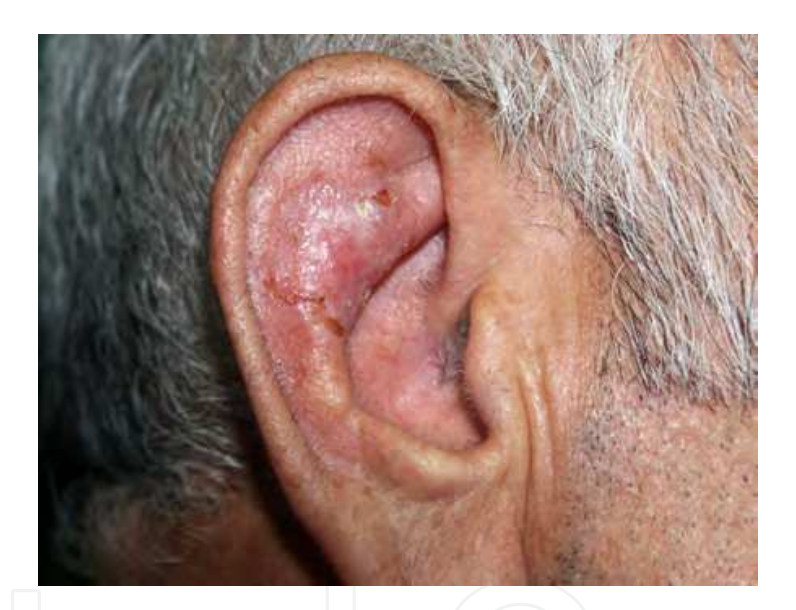
Fig. 2. Superficial spreading basal cell carcinoma located on ears.