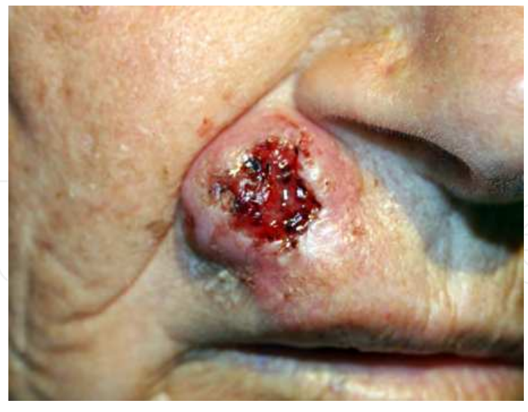
Fig. 3. Rodent ulcer type of basal cell carcinoma