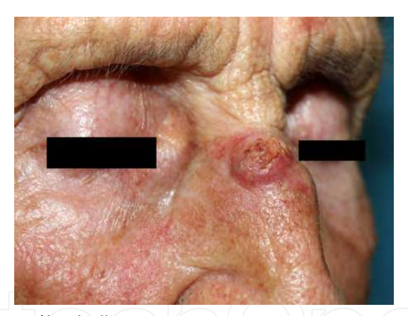
Fig. 4. Nodular type of basal cell carcinoma.

According to some authors multinodular BCC is accepted as an another subtype of BCC. It manifests a plaque-like indurated lesion with poorly demarcated contour. Lesions may be difficult to remove and so have an increased incidence of recurrence. In the pool data, subjects with a micronodular BCC had a mean age comparable with subjects with a superficial BCC but were younger than subjects with nodular or an infiltrative BCC (Betti et al., 2010).