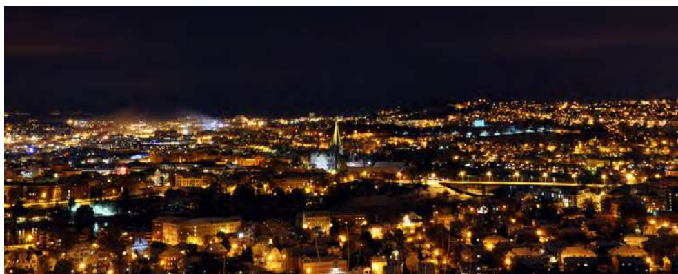
Fig. 1. The city of Trondheim (area: 342 km 2 ), with a present population of 175 000 citizens. In 2050 the number of citizens is expected to be 220 000. Presently, 80% of the Norwegian population lives in urban areas.

demand and battle for natural resources; food, water, energy and minerals. This situation will demand us to find new innovative solutions for resources management and use of materials. While we today dispose of our electronic and other modern consumables when they become tired, either for an upgrade or because it is cheaper to replace them than it is to repair them, Homo sapiens futurus will have a different approach. In the years in front of us, the concept of urban mining will be established as a standard in the New World. Recycling of metal-containing consumables like cell-phones will not only be profitable, but most likely also be required as we only have finite resources with which to build them. According to some estimates ( http://urbanmining.org ) up to 30 times as much gold can be found in cell phone circuitry as can be found in the gold ore processed in gold mines (some 150 grams, or 5.3 ounces, per ton, compared to a measly 5 grams, or 0.18 ounces per ton). To add to that, the same quantity of cell phones also contains 100 kg of copper and 3 kg of silver, as well as numerous other materials. After the devices are processed and the materials separated, these valuable metals can be sold on as high quality raw materials to build new products, which in turn also can be recycled.