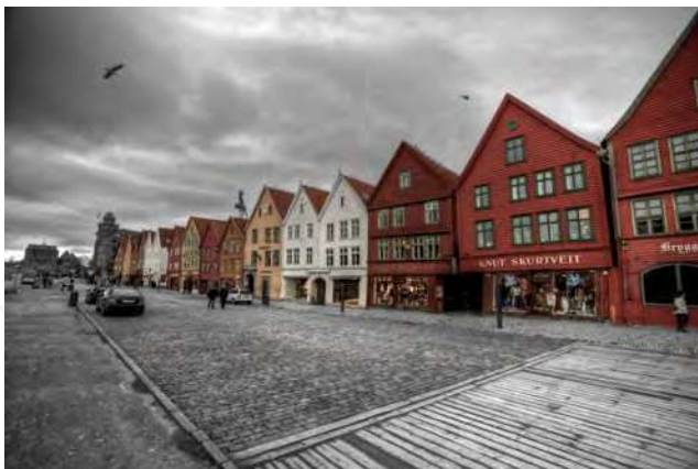
Fig. 8. The level and quality of groundwater are decisive for preserving valuable archaeological occupation layers in their original position, such as at UNESCO World Heritage Site Bryggen in Bergen, western Norway. “Groundwater data from NGU is helping to save Bryggen in Bergen”, Jørn Holme, Head of the Norwegian Directorate for Cultural Heritage.