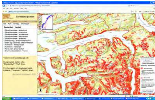
Fig. 9. The Norwegian database and map service of areas potentially at risk for landslides and avalanches provide direct access vital information to areal planners at local and national levels.

However, in general data distribution policy varies between the countries; consequently, in some of the surveys supply of selected information or materials is chargeable by law. Others, like the Geological Survey of Norway, have made the information available on an open access basis. The internet is currently being developed as the main distribution channel as it gives easy access to key information for all users. The accessible databases are updated continuously. Over the history of the Nordic surveys, and at present, securing the growing volumes of geological and environmental information has consistently proved to be efficient and economically advantageous for society.