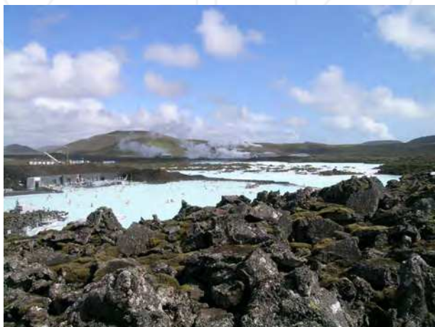
Fig. 4. The Blue Lagoon on Iceland, where people can enjoy the hot water generated from the geothermal powerplant seen in the background.

where there are have very thin crust associated with volcanic activity. One profound example is Iceland, with its sub-aerial exposures of the Mid-Atlantic Ridge, manifested by active rift zones extending from northeast to southwest on the island. The active volcanism produces a high heat flow to the surface, caused by magmas emplaced in the upper crust. This heat is extracted from both “high temperature fields” within the active volcanic zones and “low temperature fields” outside these zones. The heat is extracted as hot water and steam and is used for district heating, industrial purposes and power generation, offering a cheap and environmentally benign source of energy for the Icelandic society (Smelror et al., 2008).