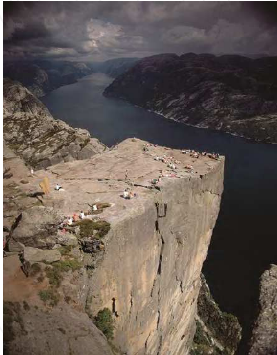
Fig. 6. Prekestolen at Lysefjorden, SW Norway. Rock-falls and landslides that will run into narrow fjords and create tsunamis which will damage near-shore settlements and infrastructure, represent potential large geohazards in Norway.

tsunamis, damaging near-shore settlements and infrastructure (Harbitz et al., 2006). The three natural disasters causing the largest number of deaths in Norway in the 20 th century involved large rock-slides in a narrow lake in Loen (1905 and 1936) and in Tafjord (1934) (Nadim et al., 2008). Currently, several unstable mountain-sides in western and northern Norway are being monitored to follow movements. A center for monitoring the unstable mountain-side at Åkneset in Storfjorden, and other areas in the Møre-Romsdalen District, is established at Stranda ( www.aknes.no ). Here is also a early-warning system, which will alarm the around 3000 inhabitants in the small communities along the fjord, and the up to 30 000 tourists visiting the World Heritage Site in Geiranger per day in the summer months, when the risk of a major rock-fall and following tsunamis has reached a given threshold, and an evacuation should take place.