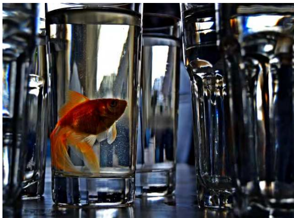
Fig. 3. Groundwater is the largest and most reliable of all freshwater resources. In many areas most drinking water is groundwater; up to 80 % in many European countries and Russia, and even more in North Africa and the Middle East (Photo: Edelpix).

freshwater in bulk is in the pipeline. Europe consumes increasing amounts of bottled mineral water, and bottled water, usually derived from groundwater, is rapidly becoming the main drinking water supply.