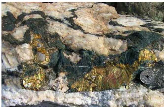
Fig. 2. Copper deposits at Repparfjord in Finmark. The Fennoscandian Ore Deposit Database (FODD) contains information on 1300 mines, deposits and significant occurrences across Norway, Sweden, Finland and NW Russia (Photo: Jan Sverre Sandstad, NGU).

commodity grades with a comment on data quality, geological setting, age, ore mineralogy and mineralization styles, genetic models, and the primary sources of data.