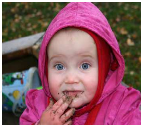
Fig. 5. Children eat soil, and in many cities moderately polluted urban soil in children's play areas represents the greatest health hazard.

The results from the studies of soil pollution at nurseries in the Norwegian cities led the Parliament in 2007 to approve a plan to map the soil pollution and to carry out clean-up operations at nurseries and school playground all over the country (Ottesen et al., 2011). Here it must be mentioned that the results of pollution-mapping in Oslo showed the greatest pollution to be in the oldest districts. All together, action was necessary at 38% of the city's 722 nurseries (Ottesen & Langedal, 2008).